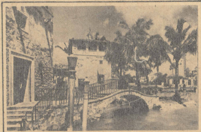
The Venetian Pool, Coral Gables, Miami, Florida

REX BEACH has written about the miracle of Coral Gables. It not only tells the amazing story of this city, but also contains certified figures and other tangible proofs of the success of Coral Gables. Send for it. Better still, come to Coral Gables and see for yourself. We will tell you about the special trains and steamships that we run to Coral Gables. Should you take one of these trips, and buy property at Coral Gables, the cost of your transportation will be refunded on your return. Sign and mail the coupon today!