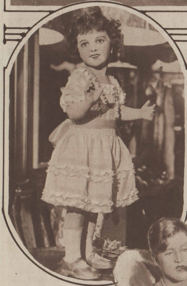
A ROYAL DOLL —This effigy of baby Princess Elizabeth was carried by Queen Mary of England in a procession at a London "doll ball." As you may remember, Elizabeth, twenty months old, is the daughter of the Duke and Duchess of York, and thus the granddaughter of the queen.