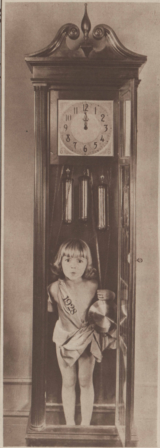
WHEN THE CLOCK STRUCK 12 , right out from among the works popped Miss 1928—a pert and saucy lady, with 'n important piece to speak: "Happy New Year to you all!"