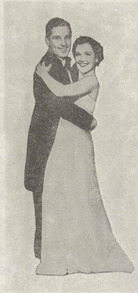
4 Gentleman brings left foot across in front of right foot preparatory to completion of full turn started in position 3. (Third count.)