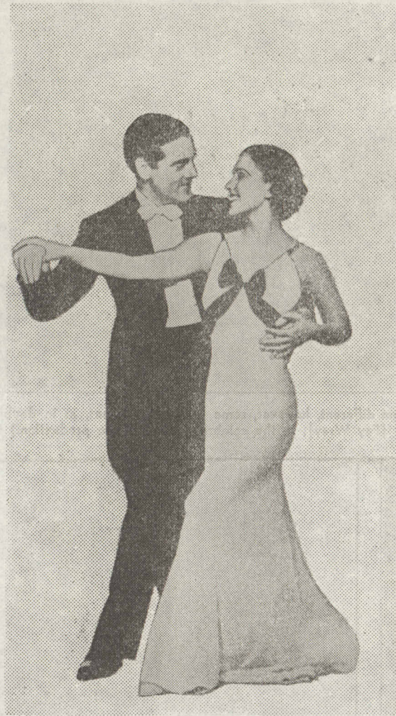
8 Both advance forward left, bending forward slightly from waist. (Second count.)