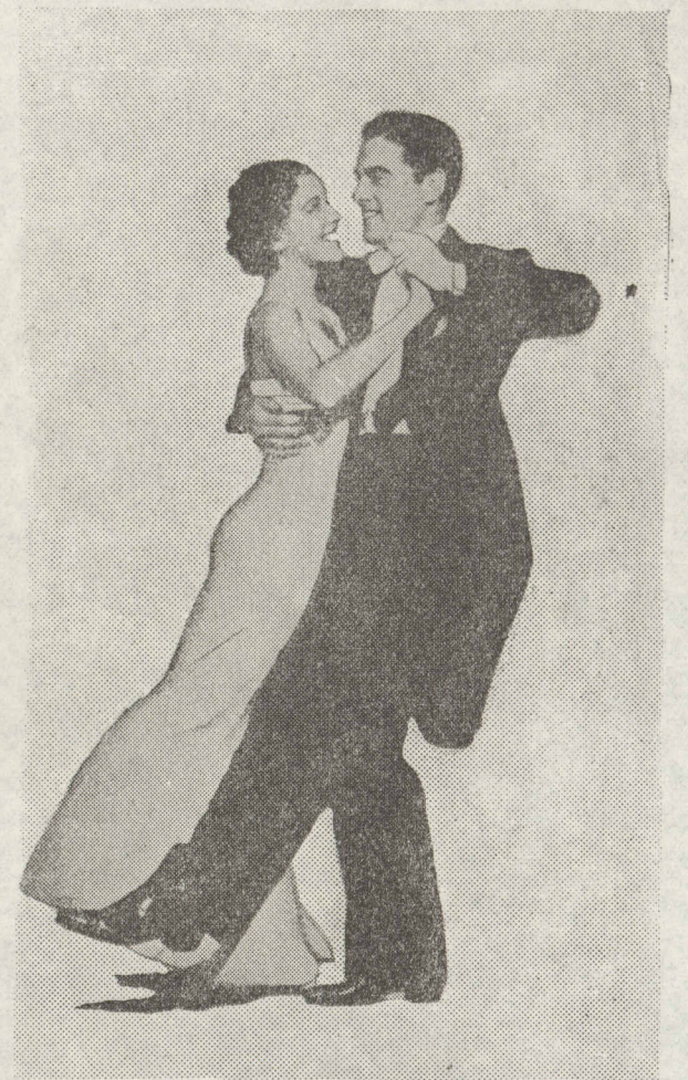
5 Gentleman steps on right foot, girl on left foot, and as turn is completed balances slightly up on half toe. Gentleman's left leg forward—girl's right leg back, slightly raised. (Counts four and five.) This completes first figuration.