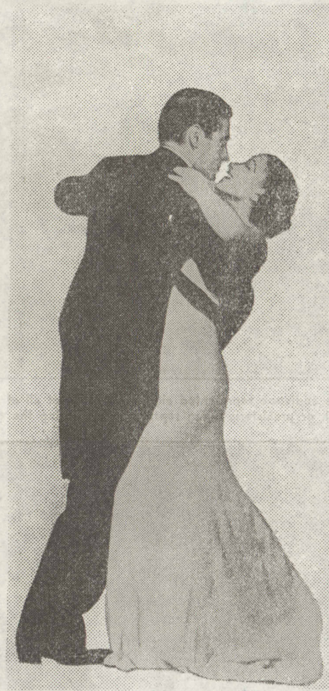
9 Girl retains position and man turns to his left, facing partner. (Third count.)