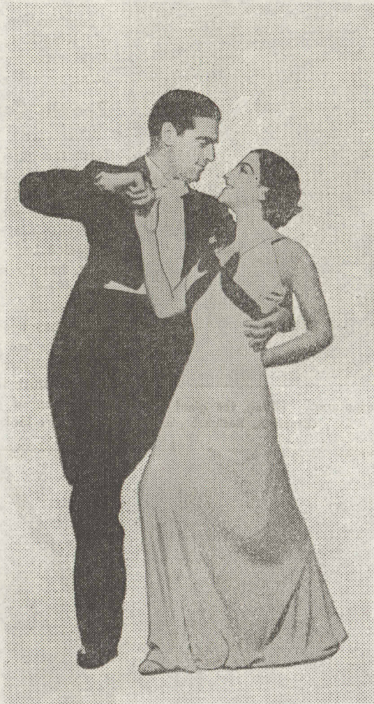
7 Both advance forward onto right foot, weight thrown slightly forward. (First count.)