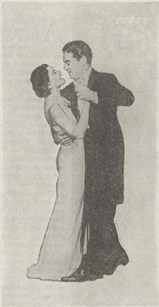
2 Gentleman steps forward with left foot. Girl steps back with right (First count clearly accented.)