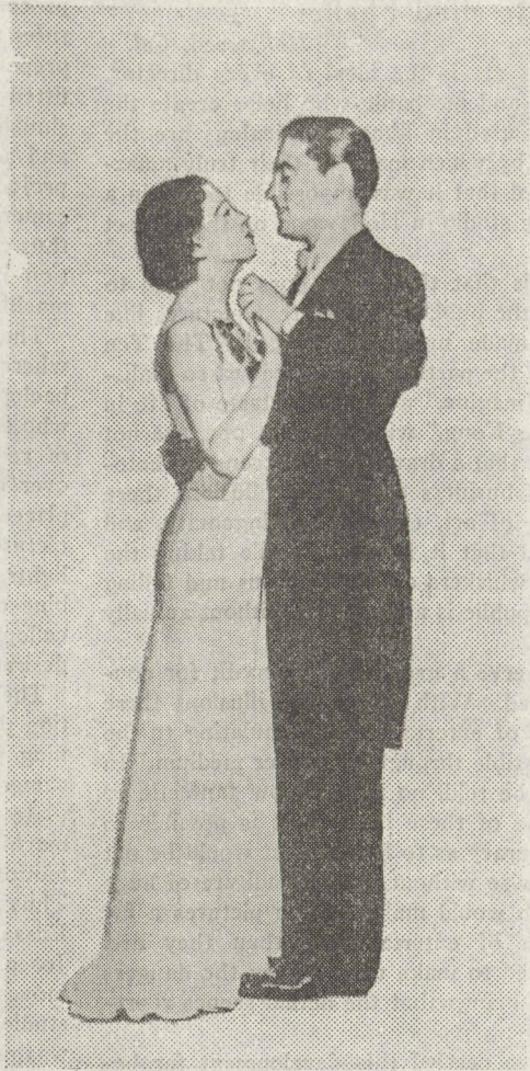
1 Regular ballroom start. Bodies erect, partner held lightly around the waist. Man's left hand slightly over girl's right hand.