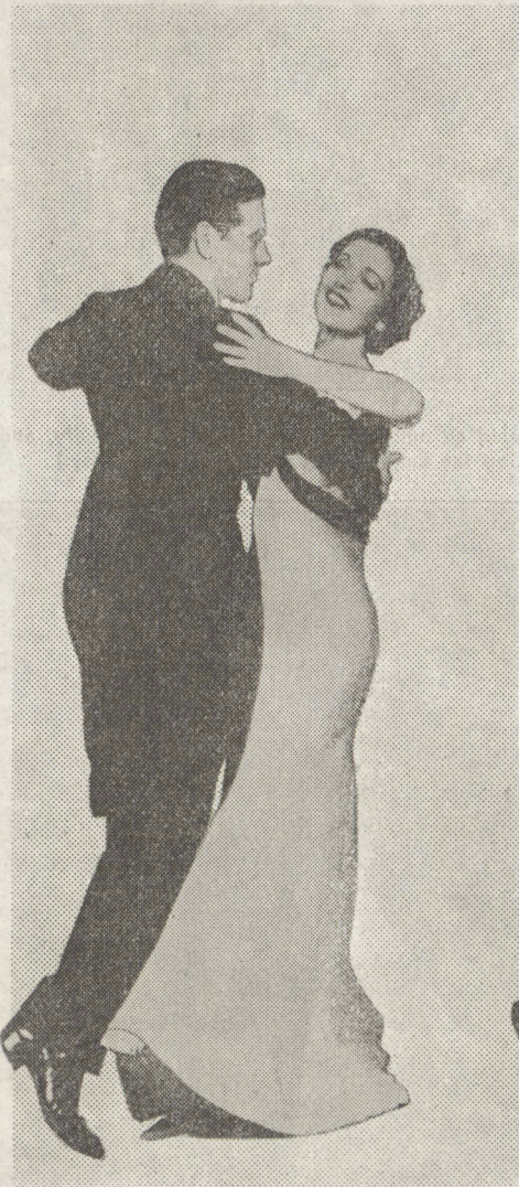
12 The knees are straightened and weight is thrown slightly forward on count two.