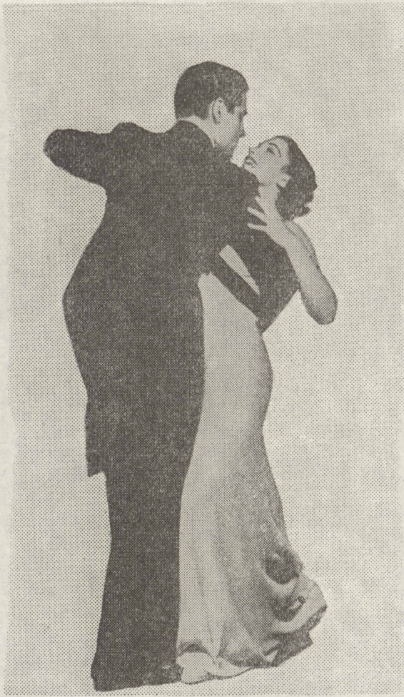
3 Gentleman advances forward right and swings girl half turn to left. (Second count.)