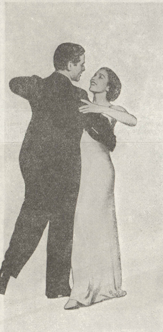
14 As balance is lost, weight of gentleman falls forward onto right leg—girl onto left leg. (Fourth count.)