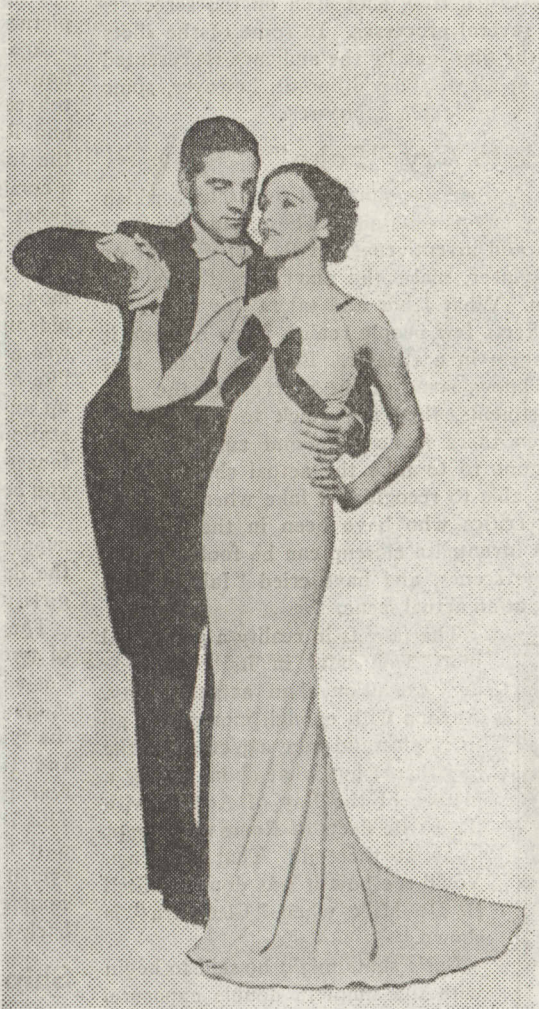
6 Gentleman stands slightly behind girl, holding her right hand in his right hand, his left arm lightly around girl's waist. Girl's left arm diagonally downward.