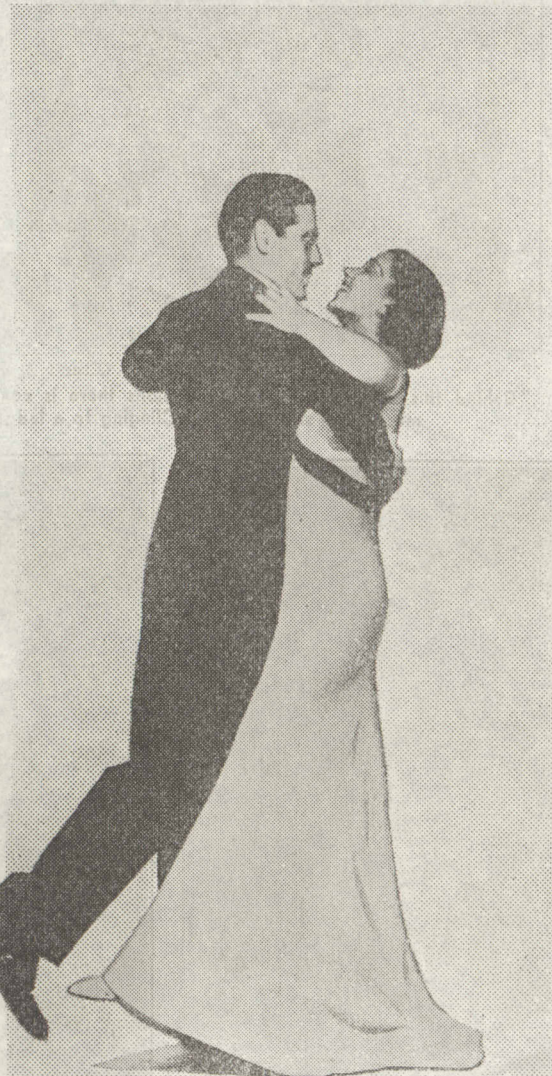
13 Both rise on half toe and lose balance—gentleman forward, girl back. Gentleman's right leg raised back, girl's left leg raised forward. (Third count.)