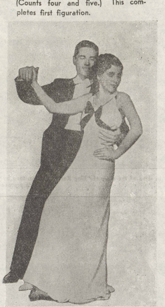
10 Gentleman swings back half turn right, his weight on left foot and the girl's weight on left foot also. Balance is performed up onto right half toes. (Counts four and five.)