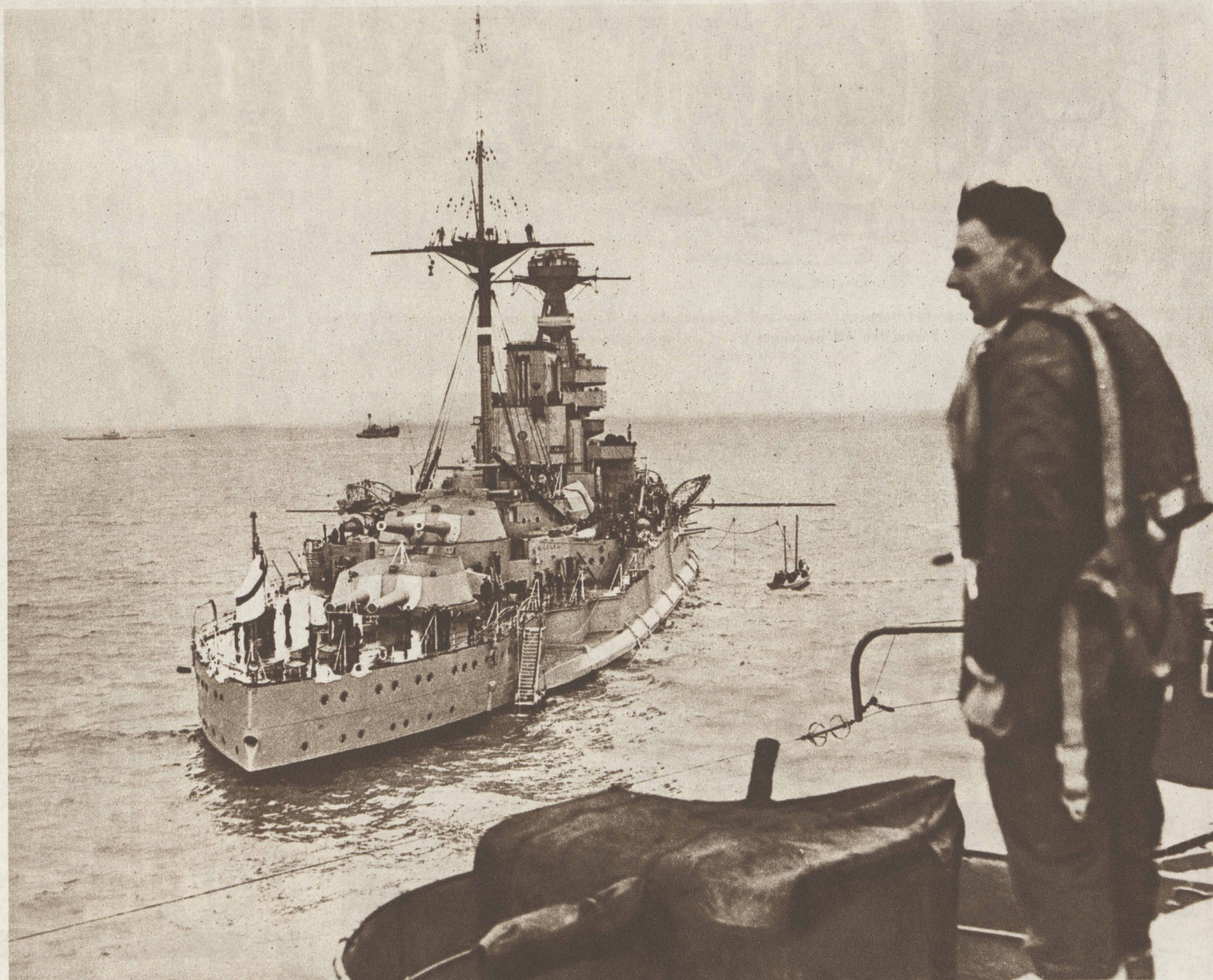
A BRITISH BATTLE WAGON, the Malaya, seen from the flight deck of the aircraft carrier Furious during the home fleet's exercises.