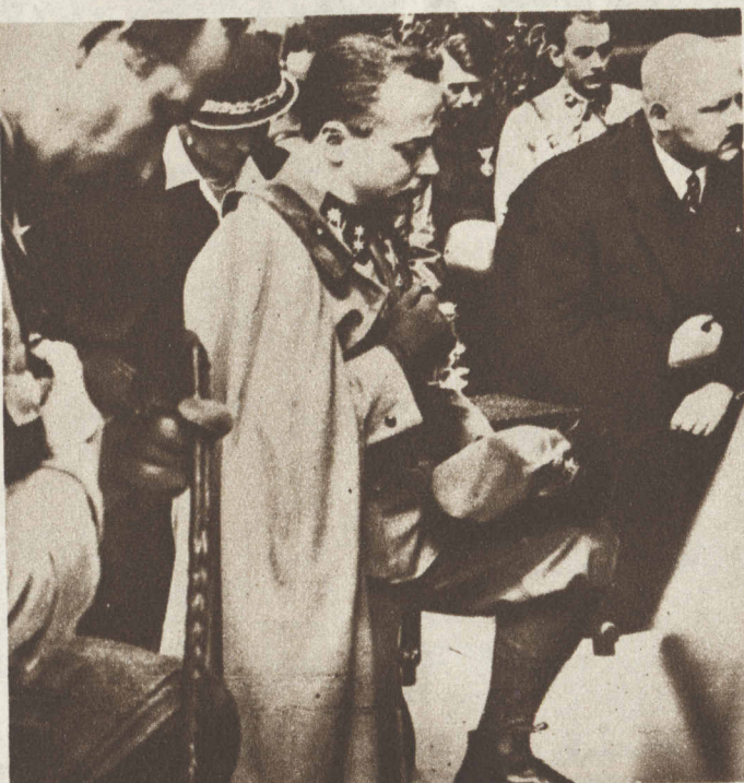
CHANCELLOR DOLLFUSS of Austria, clad in the uniform of a chasseur of the old imperial army, a regalia banned by a post-war regulation, kneels in a prayer for peace during a demonstration in Vienna.