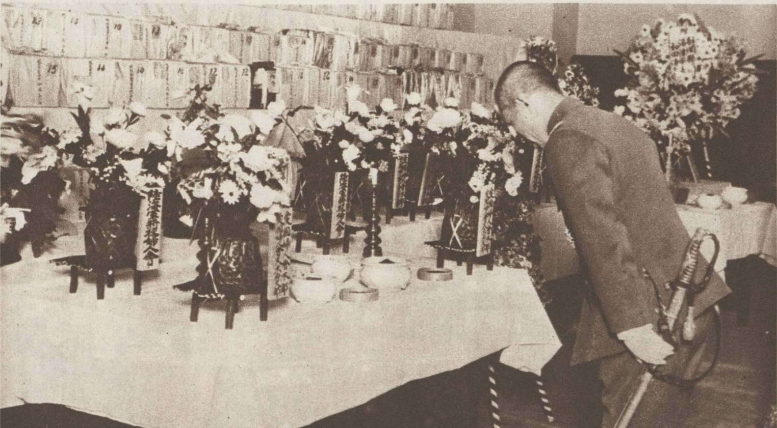
LIEUT. GEN. SADAO ARAKI, Japanese minister of war, bows before the altar containing the ashes of 104 soldiers of the Nipponese empire who fell in the Chinese campaign.

(Photos reproduced through the courtesy of "Proceedings," published by the U. S. Naval institute at Annapolis, Md.)