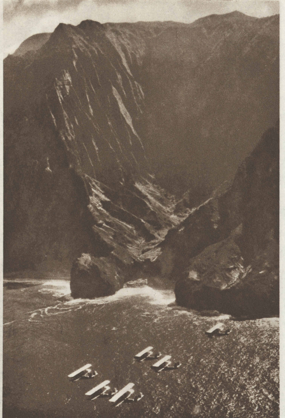
THREE PICTURES taken by U. S. naval photographers in the territory of Hawaii. Above at left is a view of the leper colony at Kaulaupapa, Molokai; at right, a Kauai cliff on the Napali coast.