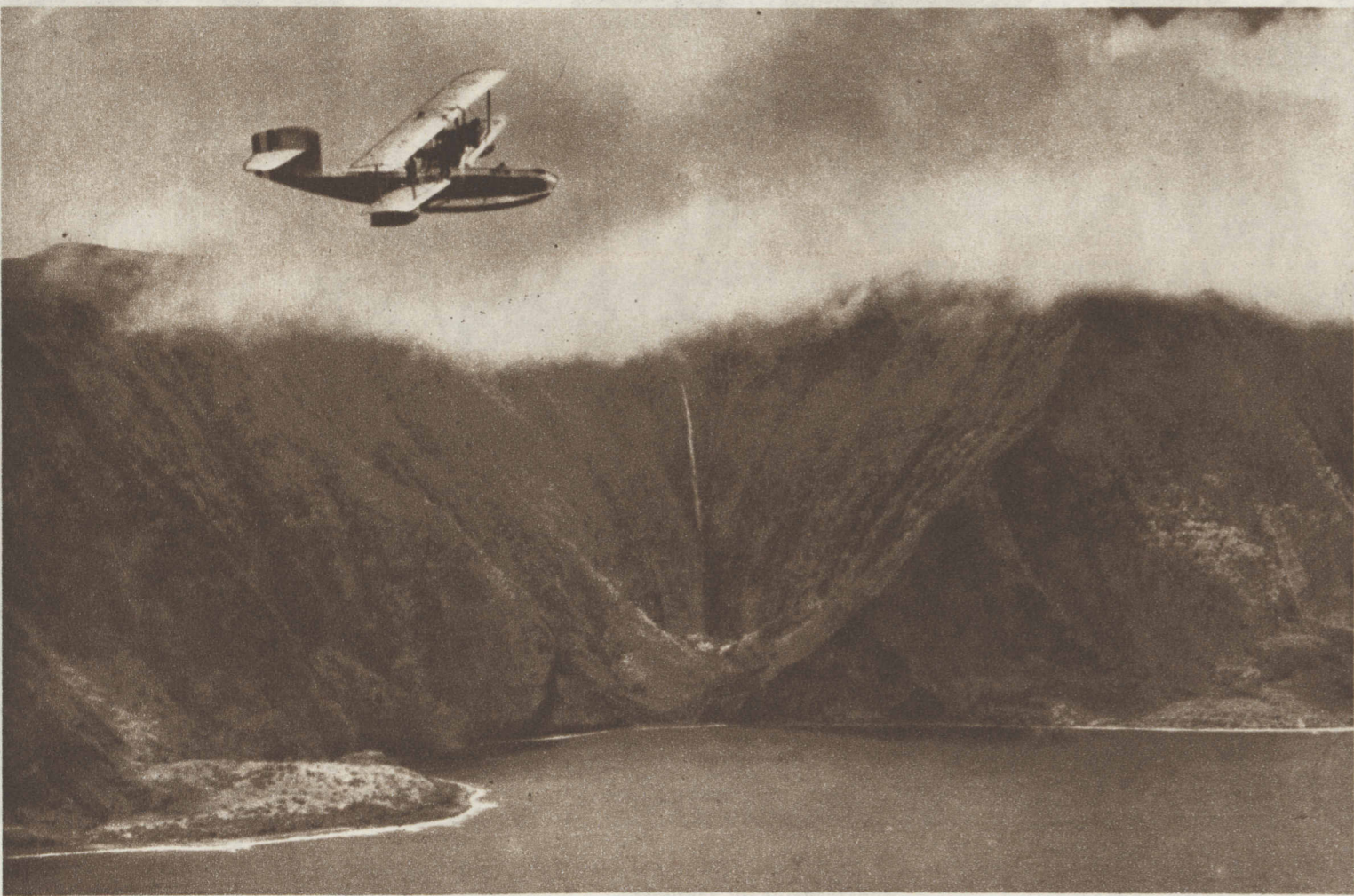
A NAVAL PLANE near one of Molokai's innumerable waterfalls.