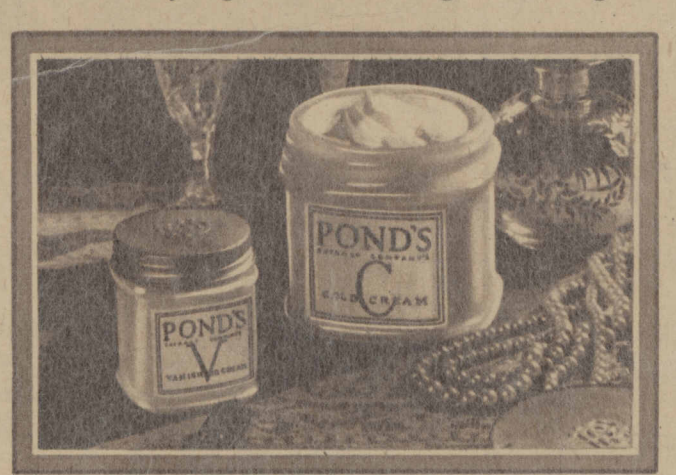
THE TWO CREAMS the beautiful girls of the younger set are using

FOR cleansing, refreshing and keeping supple your delicate skin, apply Pond's Cold Cream lavishly. Do this every night before retiring and during the