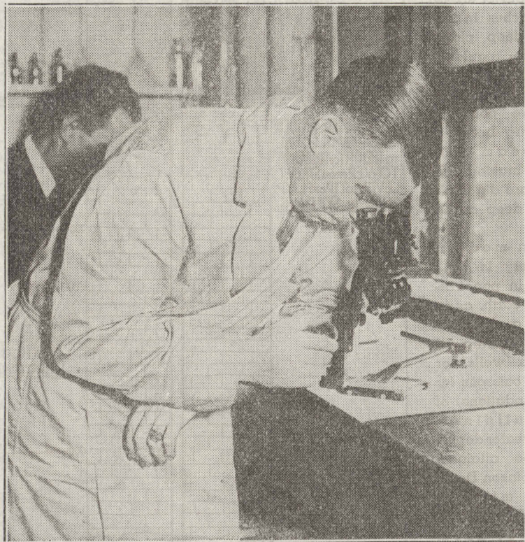
A police official examining a "jimmy" with a binocular microscope, which detects identifying marks on the instrument.