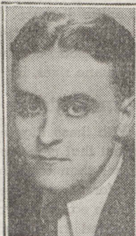
F. Scott Fitzgerald