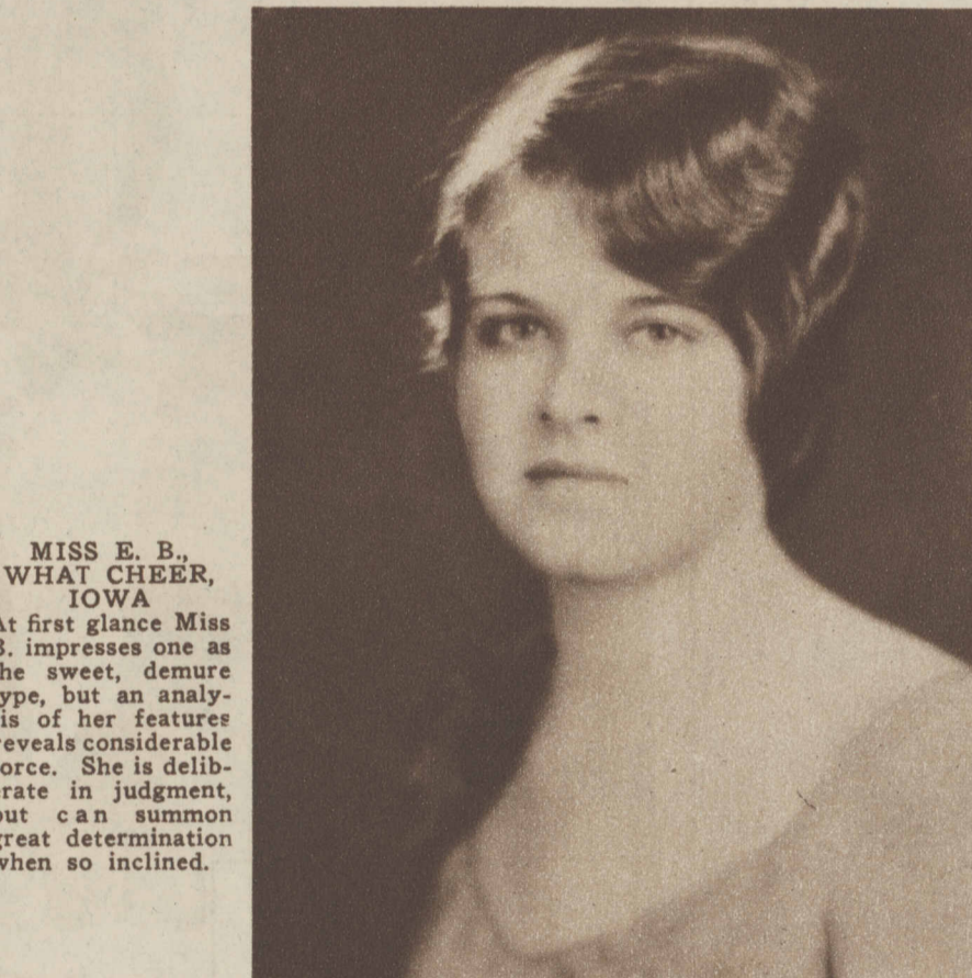
MISS E. B., WHAT CHEER, IOWA At first glance Miss B. impresses one as the sweet, demure type, but an analysis of her features reveals considerable force. She is deliberate in judgment, but can summon great determination when so inclined.