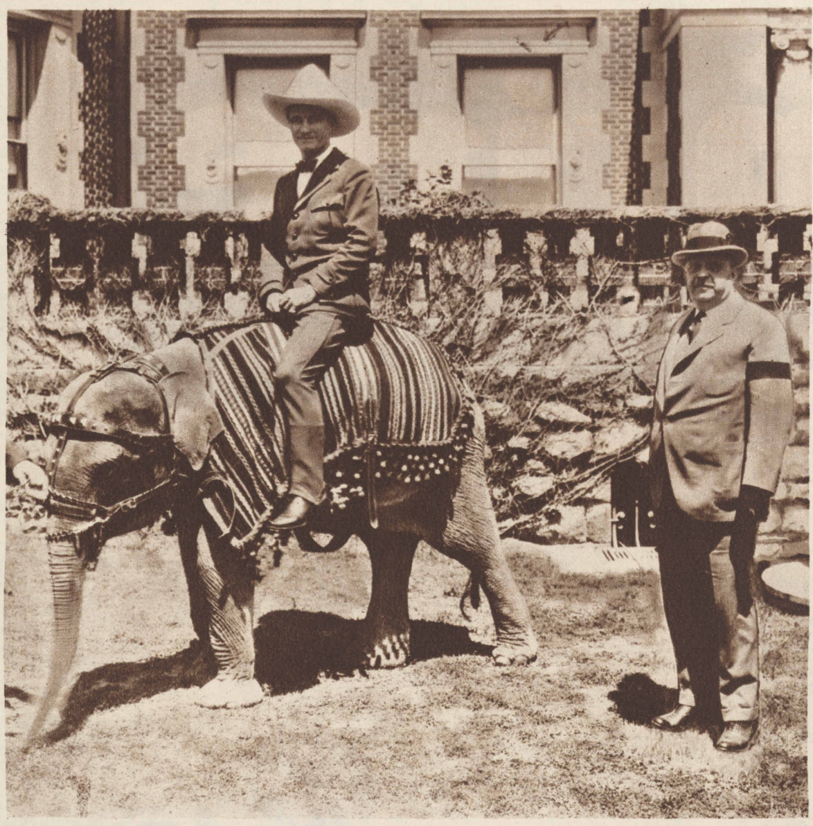
THIS REMARKABLE PHOTOGRAPH was captured on a recent occasion when Tom Mix was visiting August Busch and entertaining the children at Grant's Farm, site of General Grant's home on the Gravois road, near St. Louis. The elephant was Mr. Busch's Christmas gift to his grandchildren.