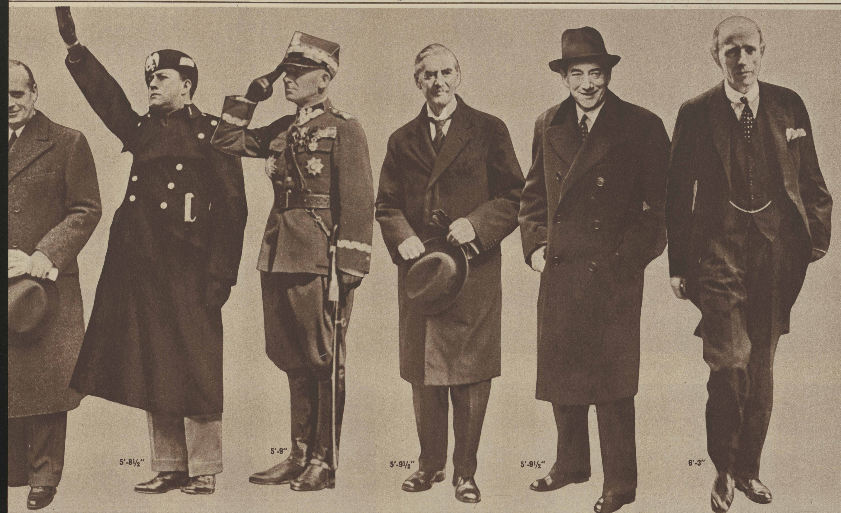
FOREIGN MINISTER VON RIBBENTROP GERMANY