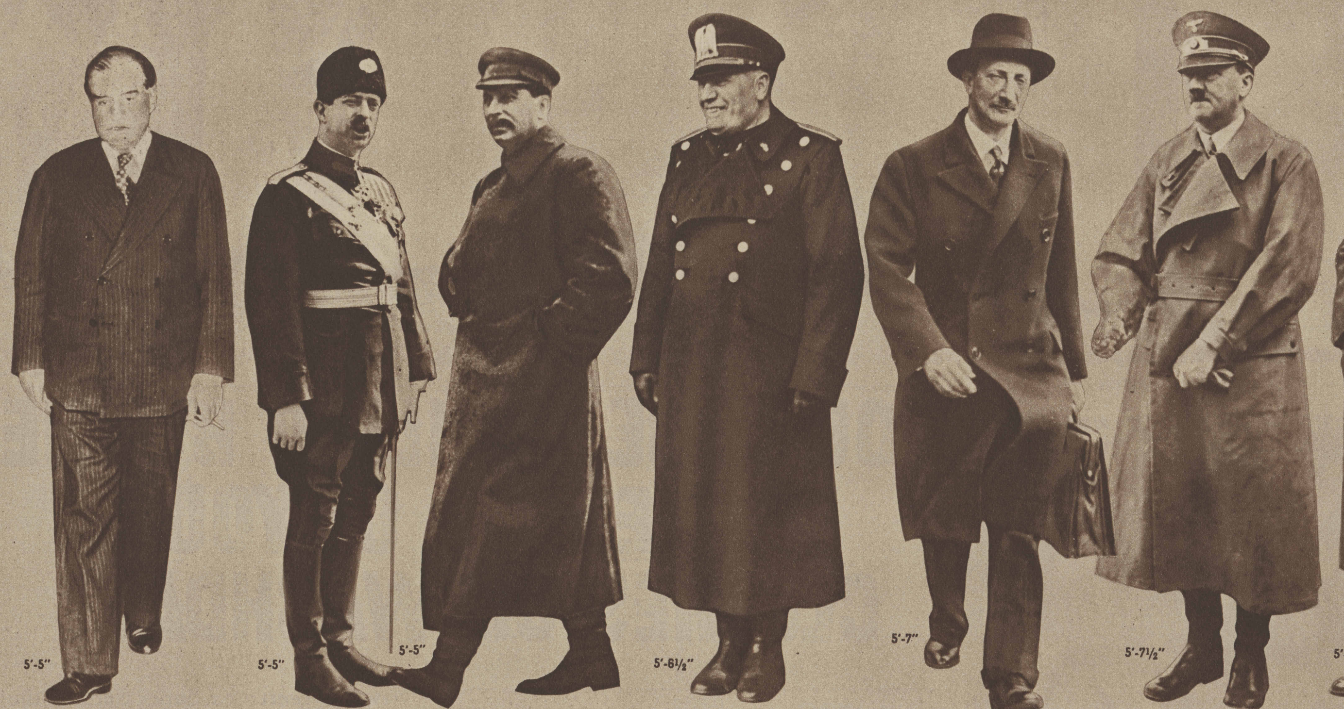
PREMIER DALADIER FRANCE

Comparative Heights of the Men Who Guide Old World Destinies.