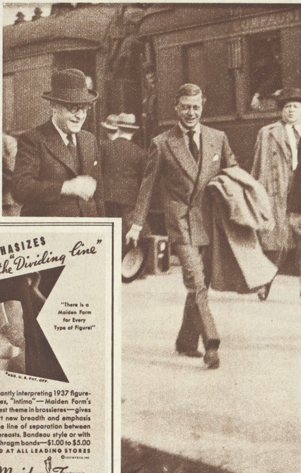
THE MAN WHO ABDICATED the throne of England, the duke of Windsor, arrives in France to join Mrs. Wallis Warfield, the woman for whom he gave up the crown.