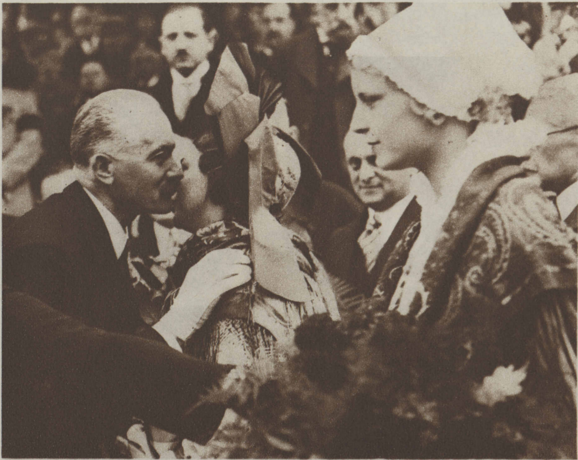
A KISS FROM PRESIDENT LEBRUN at a Parisian fete.