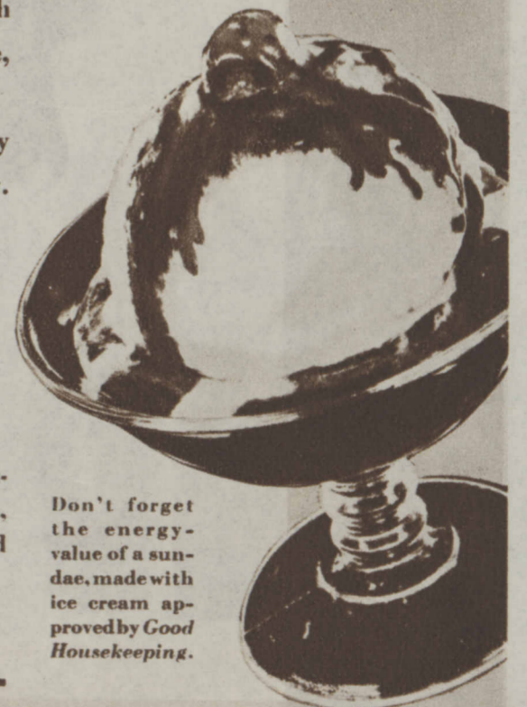
Don't forget the energy-value of a sundae, made with ice cream approved by Good Housekeeping.