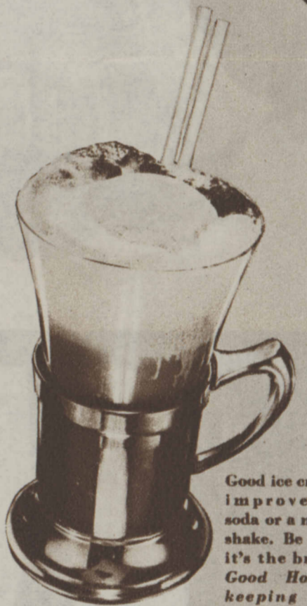
Good ice cream improves a soda or a milkshake. Be sure it's the brand Good Housekeeping approves.