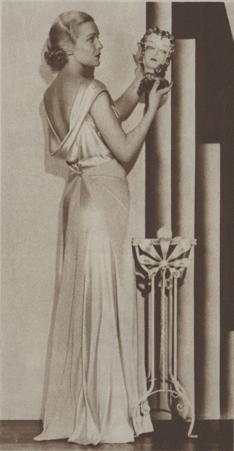
A MUCH MOULDED GOWN of crepe back satin with cowl back decollete and flaring skirt that breaks into a brief train is modeled by Madeleine Carroll of the films.