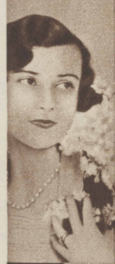
THE COUNTESS OF GALLOWAY