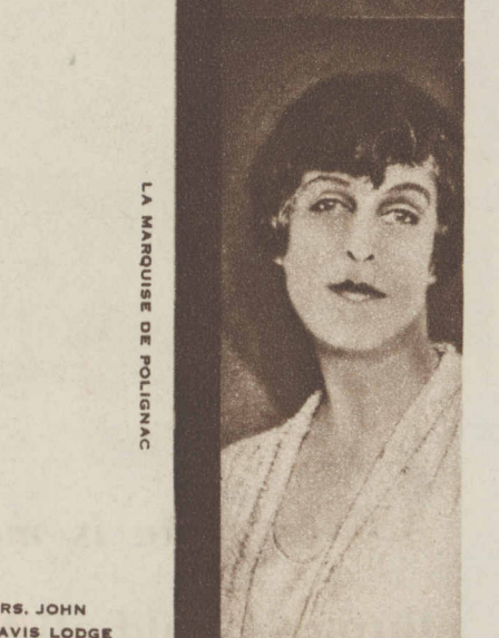
LA MARQUISE DE POLIGNAC