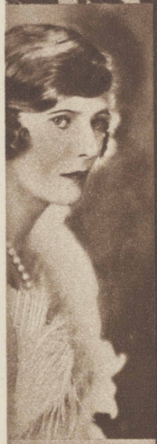
THE COUNTESS HOWE