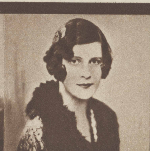
THE VISCOUNTESS WEYMOUTH