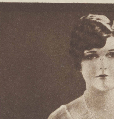
MRS. CORNELIUS VANDERBILT, JR.