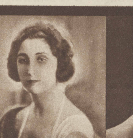
MRS. JOHN DAVIS LODGE