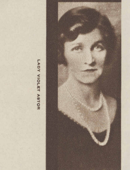
LADY VIOLET ASTOR