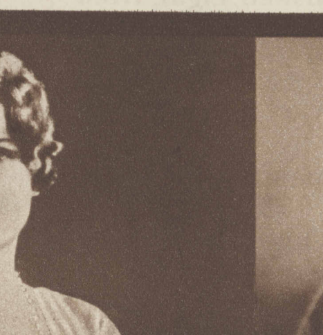
LA DUQUESA DE ALBA