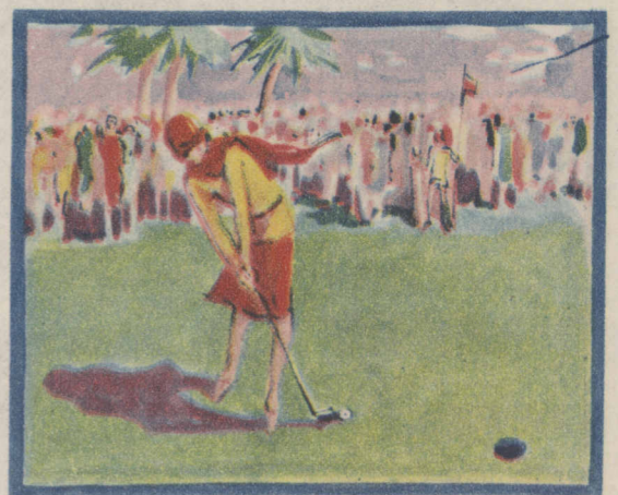
Golf Is Popular Everywhere in Florida