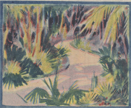
Luxuriant Foliage—Central Florida