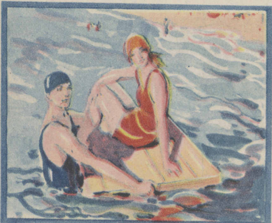
Bathing in Tropical Waters