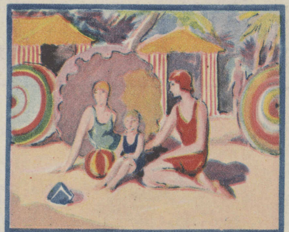
On the Florida West Coast