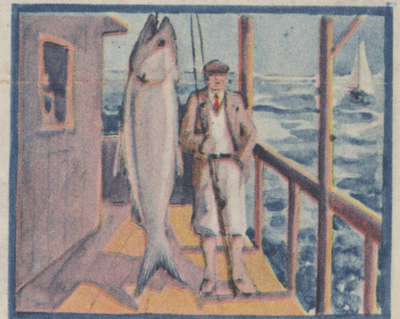
Tarpon Fishing, St. Petersburg, Fla.