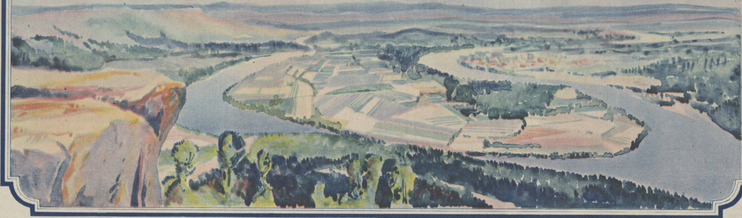
MOCCASIN BEND FROM LOOKOUT MOUNTAIN, CHATTANOOGA, TENN.