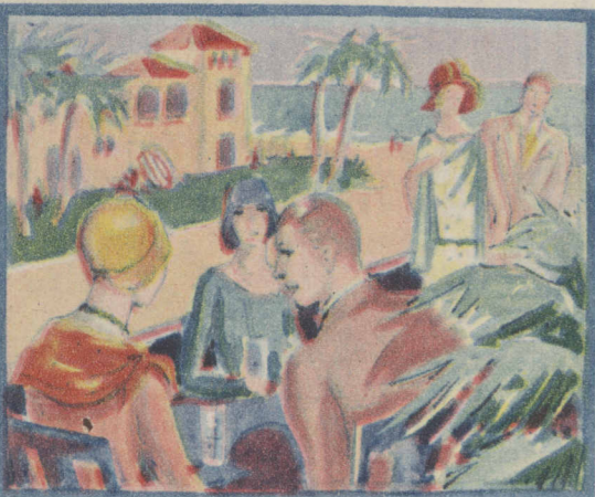
Smart Hotels Attract Thousands

Evansville—Gateway to Dixieland—Nashville, Chattanooga, Moccasin Bend, Missionary Ridge, Chickamauga National Park and Atlanta.