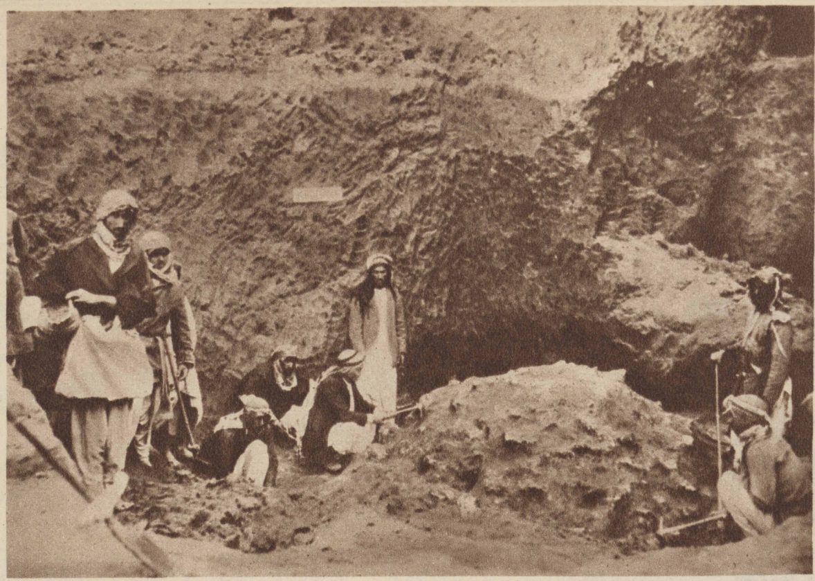
WHERE ABRAHAM LIVED, in the scriptural city of Ur of the Chaldees, a joint archeological expedition of the University of Pennsylvania and the British Museum has unearthed remarkable finds. Here workmen were clearing away the dome-shaped stone roof of an intricate grave, which yielded a treasure of gold jewelry.