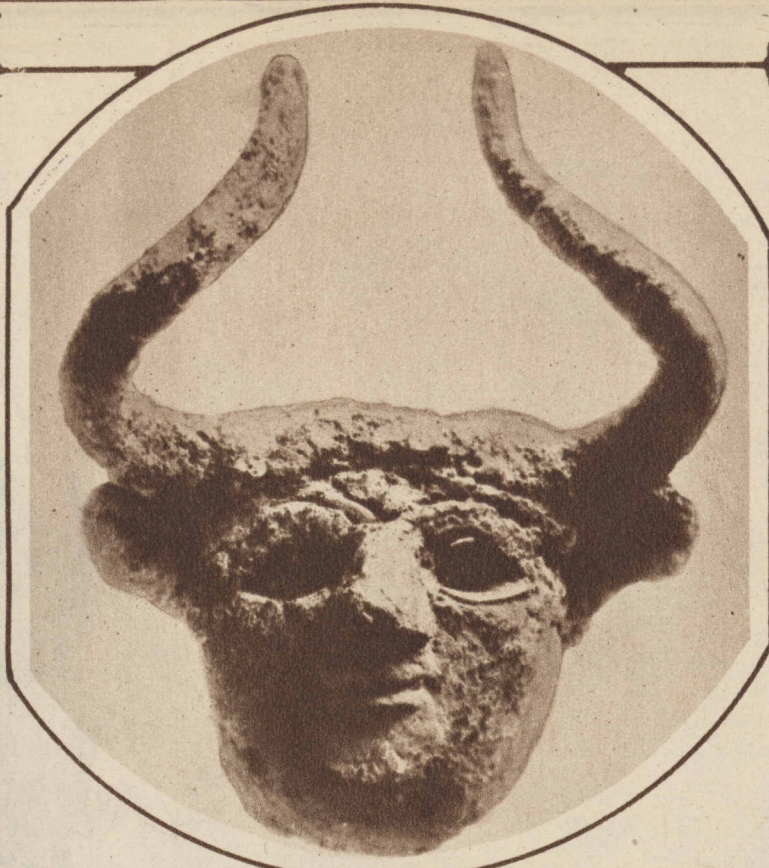
A RELIC OF UR—An ancient cemetery gave up this copper figure, fashioned with human features and the horns and ears of a bull.