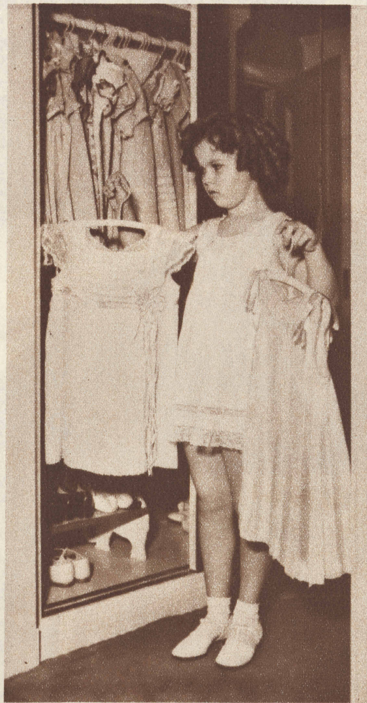
3 She chooses the dress in her right hand—pale pink crepe, pleated skirt, lace yoke, rosette of pale pink satin ribbons.