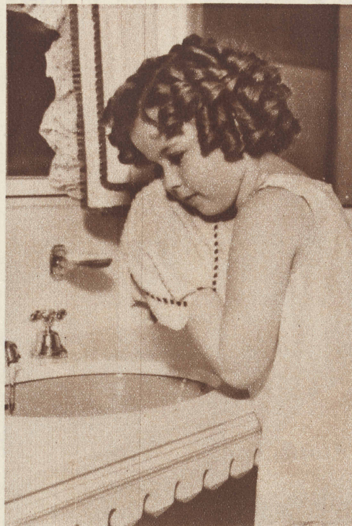
1 Shirley Temple gets ready to go to her first world premier, the 20th Century-Fox production of "Wee Willie Winkle," in which she is starred.