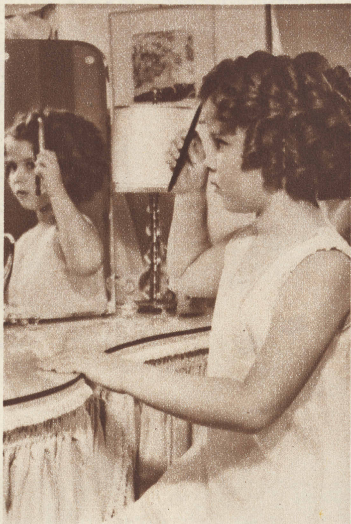
2 Movieland's No. 1 star touches a comb to her curls. This is high adventure for Shirley; rarely is she allowed even to stay up past bedtime.