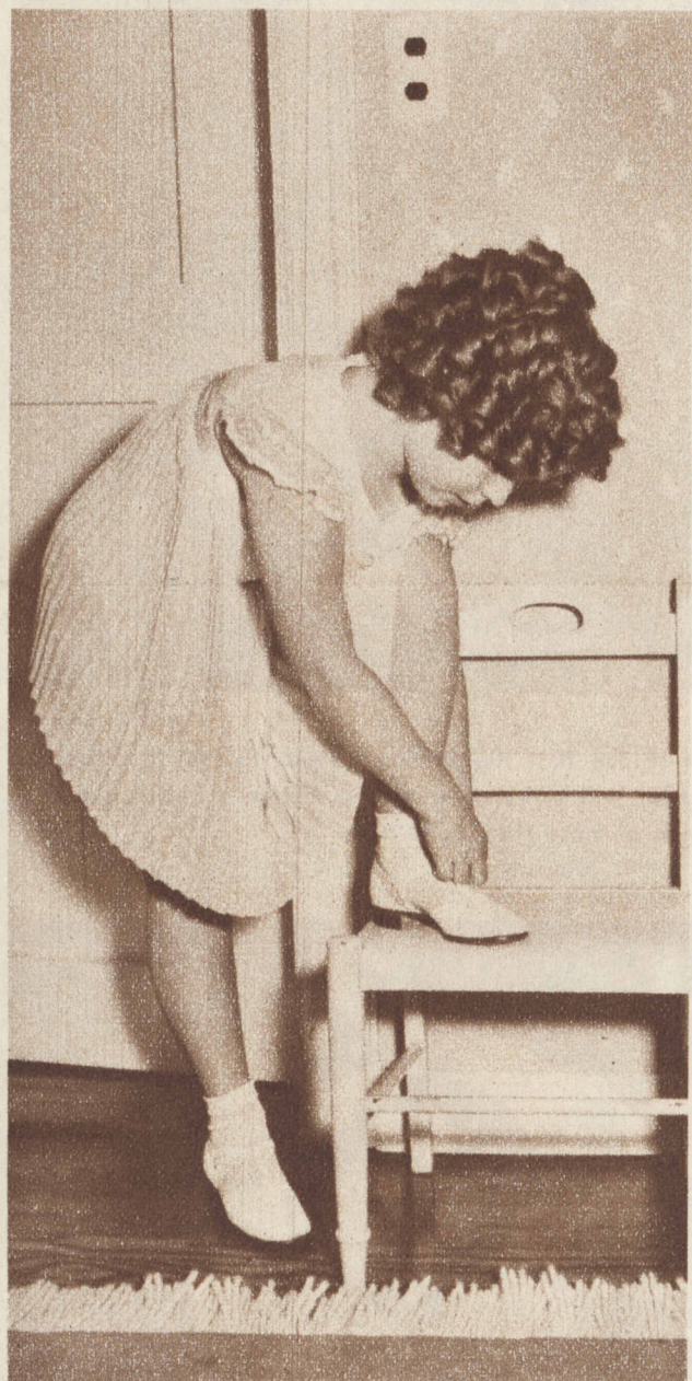
5 And makes sure the straps of her shoes are securely buckled.