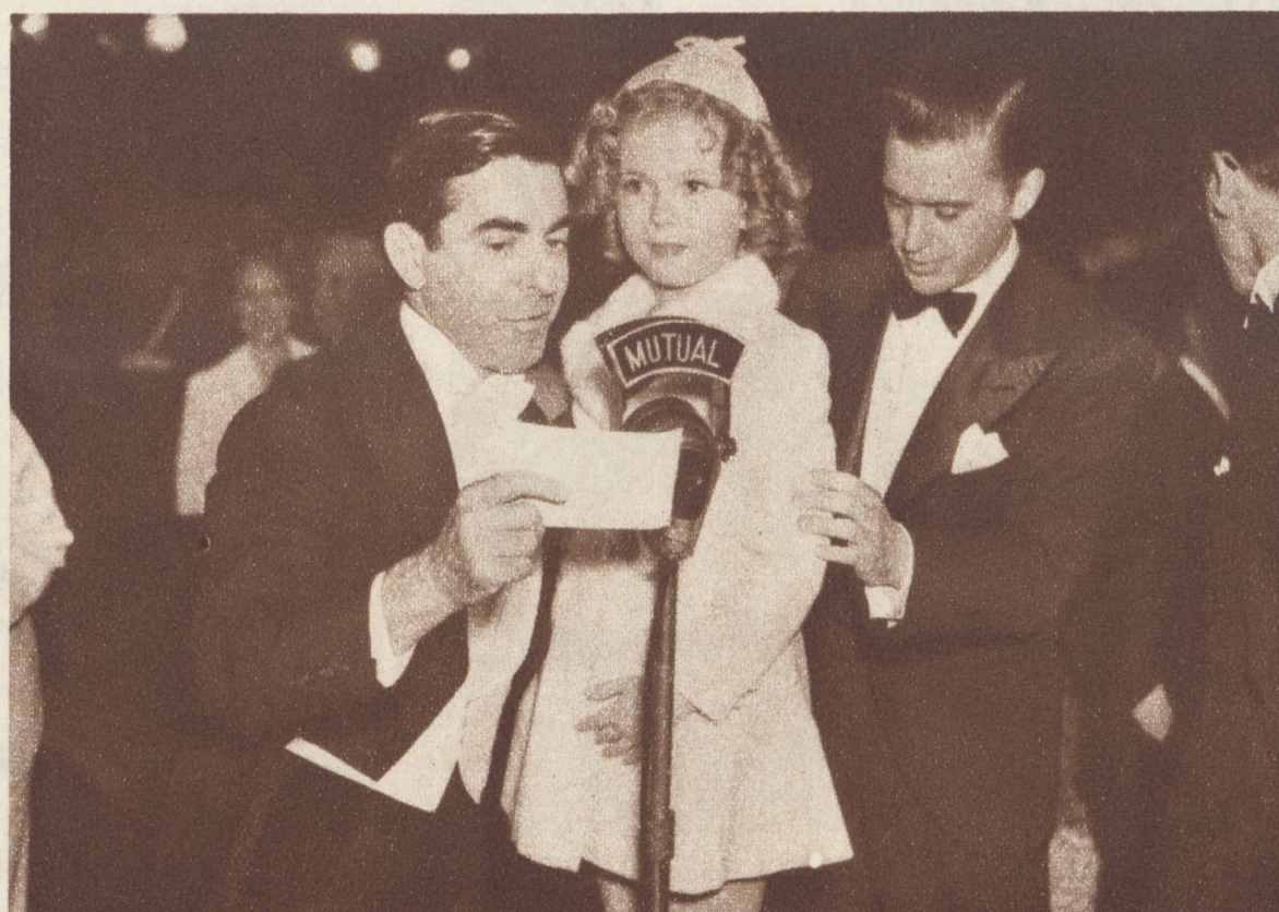
9 She is "put on the air" by Eddie Cantor. "This is the biggest day I ever had," Shirley broadcasts, "and today I was promoted to the high fourth grade. Gosh, I'm happy!"