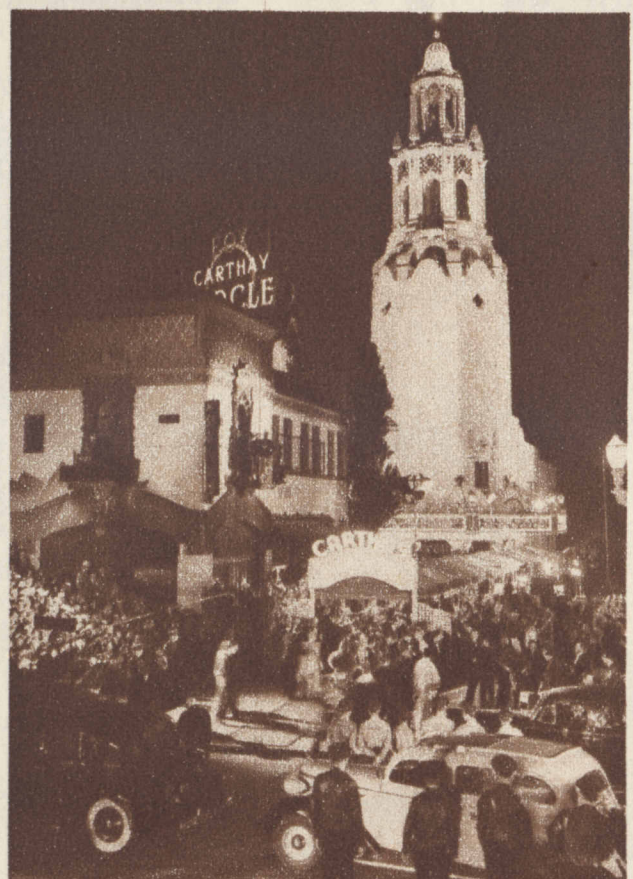
8 This is the sight that meets Shirley's eyes. Hundreds of lights are trained on the forecourt of the theater. Gleaming cars roll up, stars emerge and walk down a promenade of flowers.