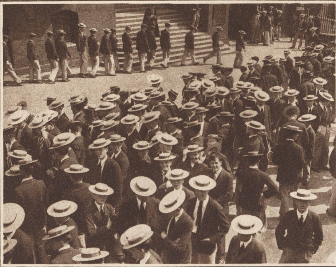
THEY CALL THESE HATS IN ENGLAND—Harrow schoolboys.