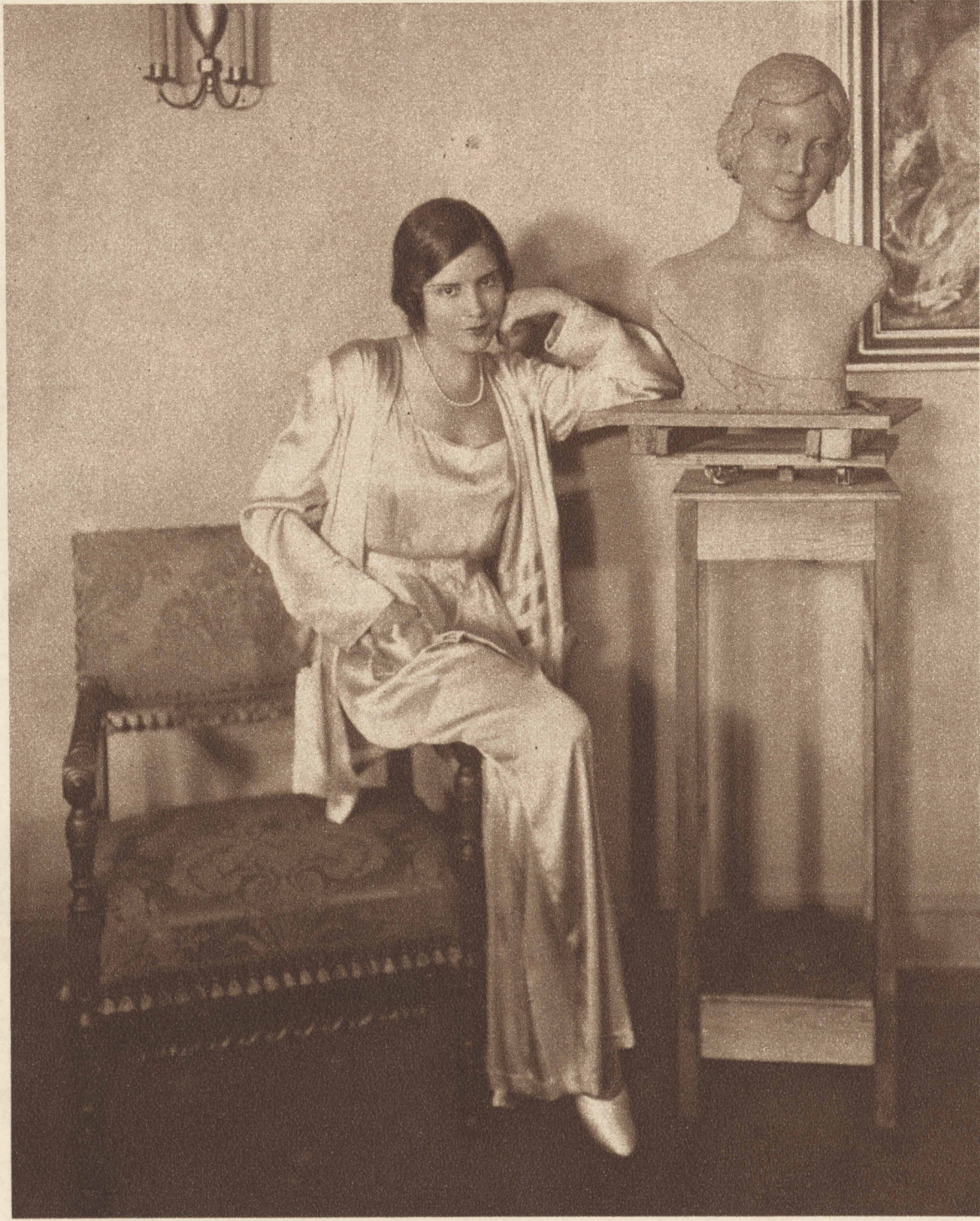
Countess Olga Albani