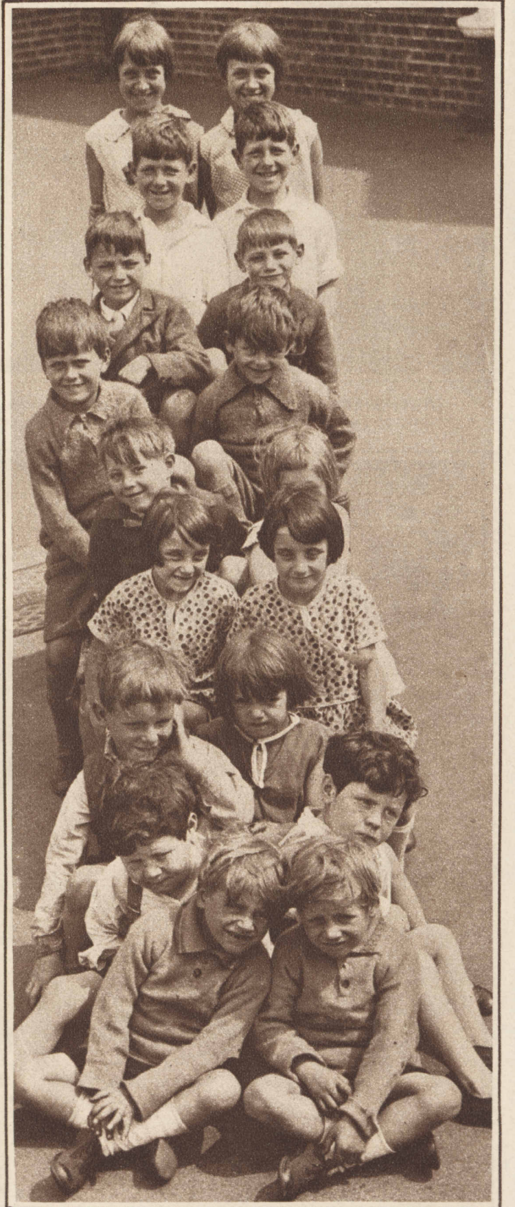
THESE NINE SETS OF TWINS attend a school in Edmonton, London, where all are pupils in the same class.