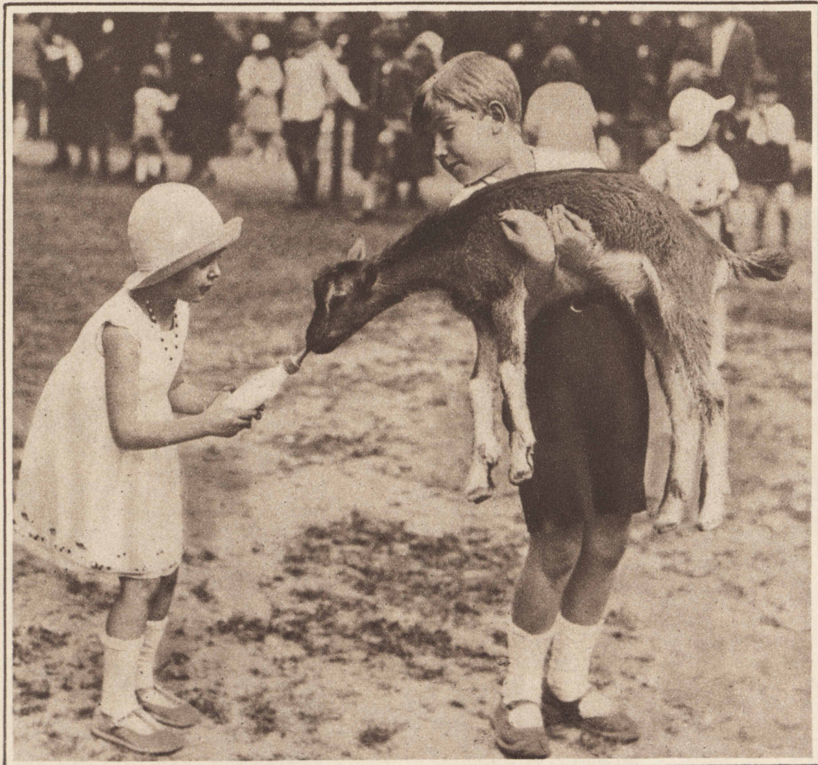
BOTTLE FED—This kid at the Paris children's zoo finds the position in which he is being held no handicap to satisfying his appetite.