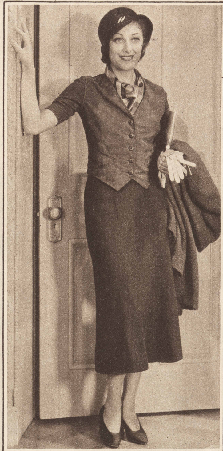
ANN DVORAK models this smart sports suit of dark ratine with suede vest worn over a jersey. The scarf is of bright colored plaid silk.