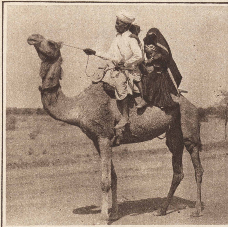
FAMILY EQUIPAGE—The whole family goes for a ride on their camel, perhaps on a shopping tour to Delhi, near which Indian city this photograph was taken.