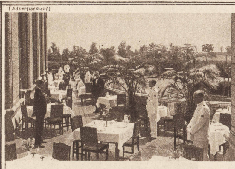
Dining outdoors at the Hotel Shoreland—55th Street at the Lake—under a canopy of stars, with Lake Michigan in the offing—is a real summer treat—fascinating, delightful. Cool—gay—a setting that even to smart, sophisticated people is unique and different. An extraordinary Shoreland menu.