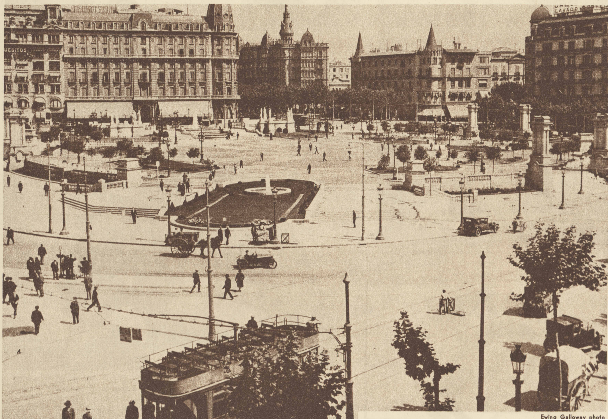
BARCELONA, TAKEN BY THE NATIONALISTS.