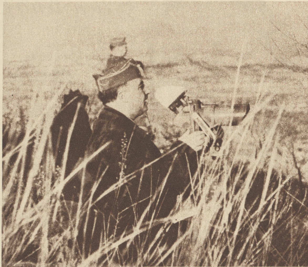
GEN. FRANCO ON THE CATALONIAN FRONT.