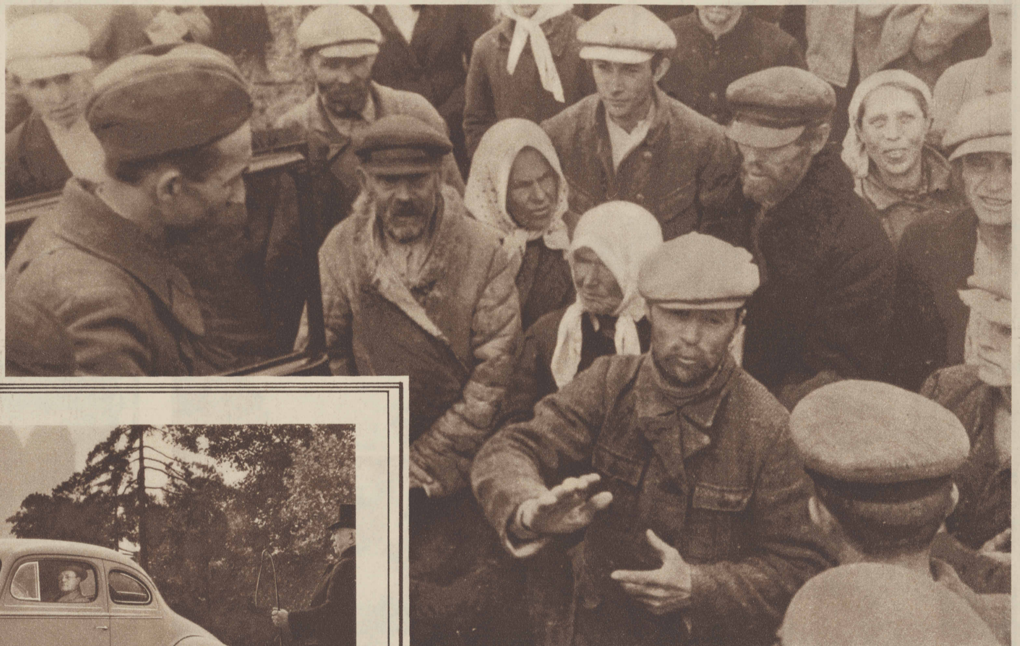
A SOVIET SPELLBINDER PROPAGANDIZES IN POLAND.