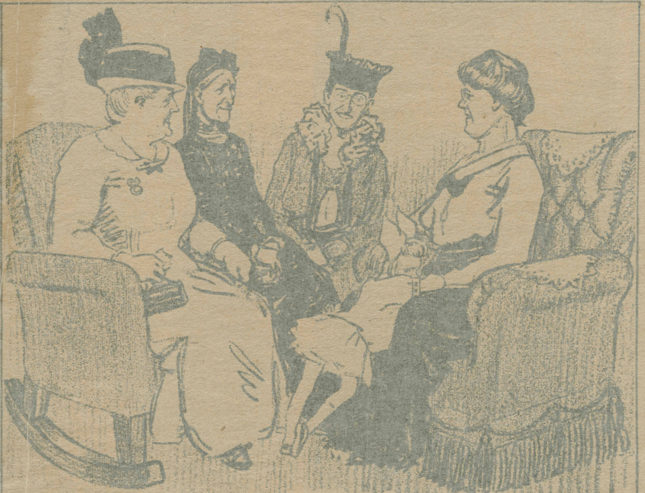
"I DON'T KNOW WHAT AILS HER—USUALLY SHE TALKS ALL THE TIME—ONLY YESTERDAY SHE SAID SUCH CUTE THINGS!"