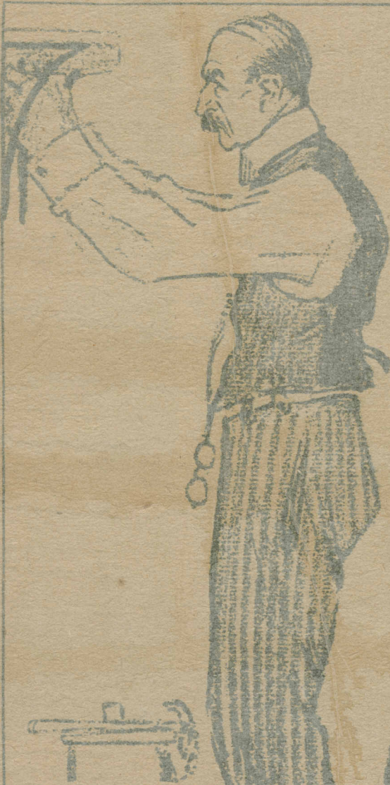
DOING AN ODD JOB AROUND THE HOUSE FOR THE BEST LITTLE WOMAN.