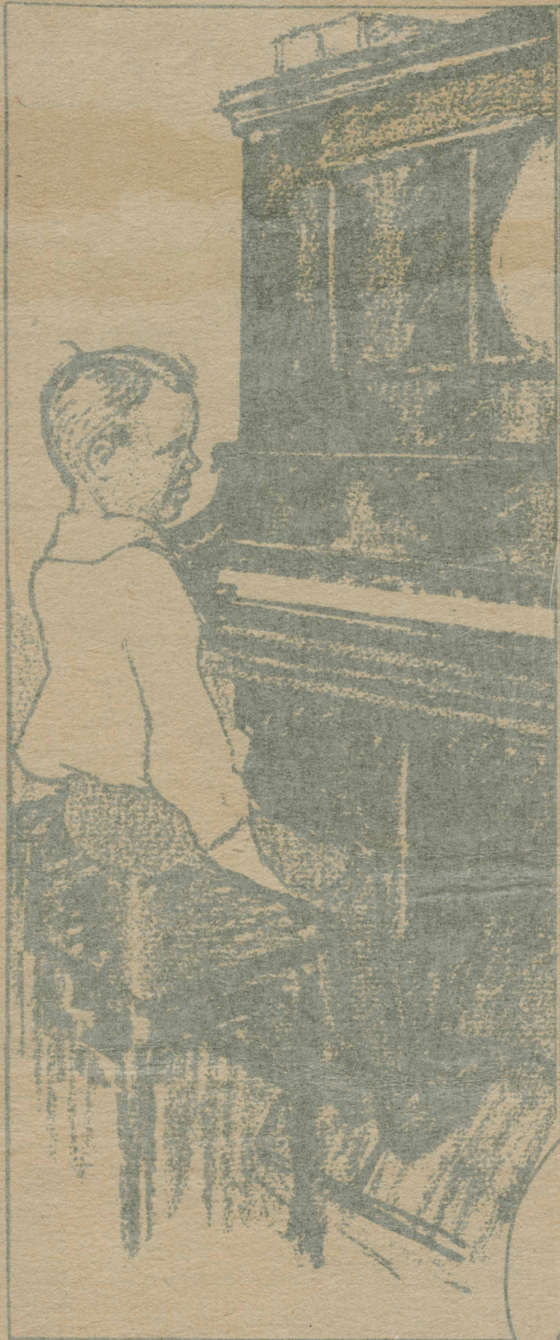
LITTLE FRANKIE SPENDS SUNDAY AFTERNOON PLAYING HANDEL'S LARGO PRESTO CON FUOCO.