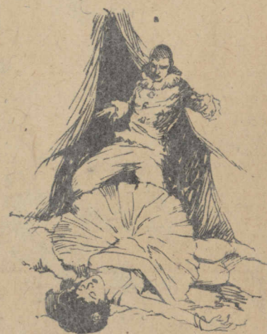
Stage history reveals the case of a young dancer who seeking a sensation painted her body from head to foot. This violation of nature's laws caused her death.