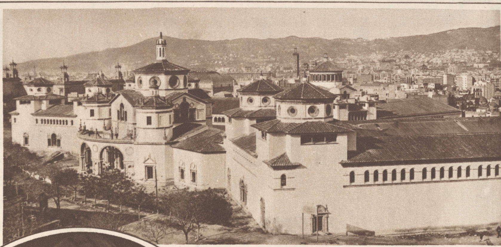
THE PALACE OF AGRICULTURE at the Barcelona exposition will house displays of viticulture, olive culture, and of all manner of products of the Spanish soil. The oddly-shaped structure is one of a group of buildings occupying an area of nearly 280 acres.