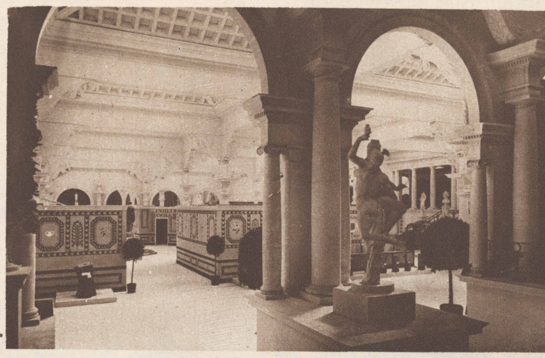
IN THE QUEEN VICTORIA EUGENIA PALACE, which will inclose the exhibits of numerous countries co-operating in the Barcelona fair.