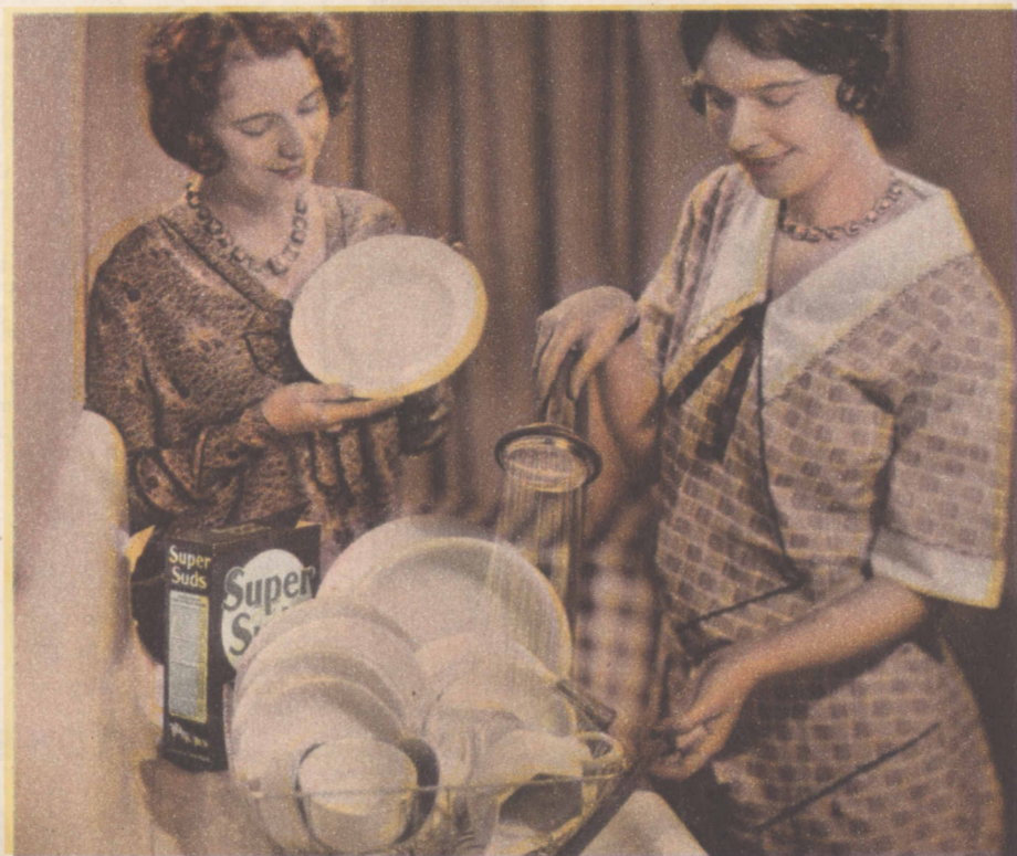
Dishes need no wiping - when washed with Super Suds! Just a hot rinse and dishes drain dry, bright and sparkling.

You have instant suds on top. But, much more important, you get instant suds all through the water .