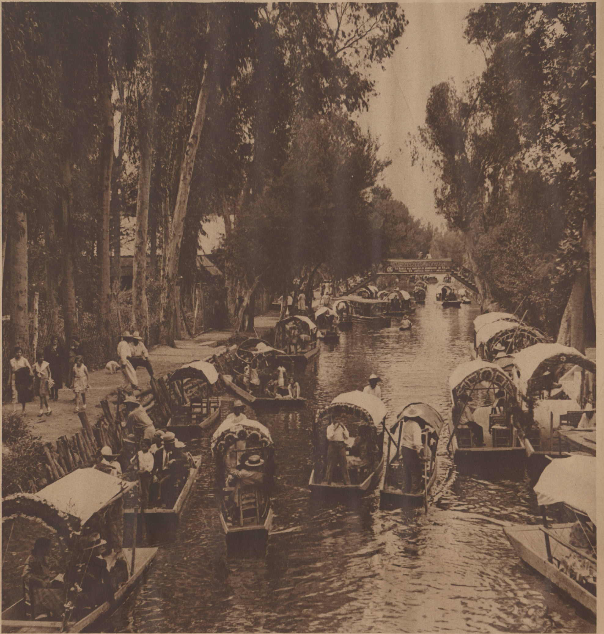
SCENE ON THE VIGA CANAL, bustling waterway from Mexico City to Ochimilco.

The fashion news is Silk The store news is The Silk Parade