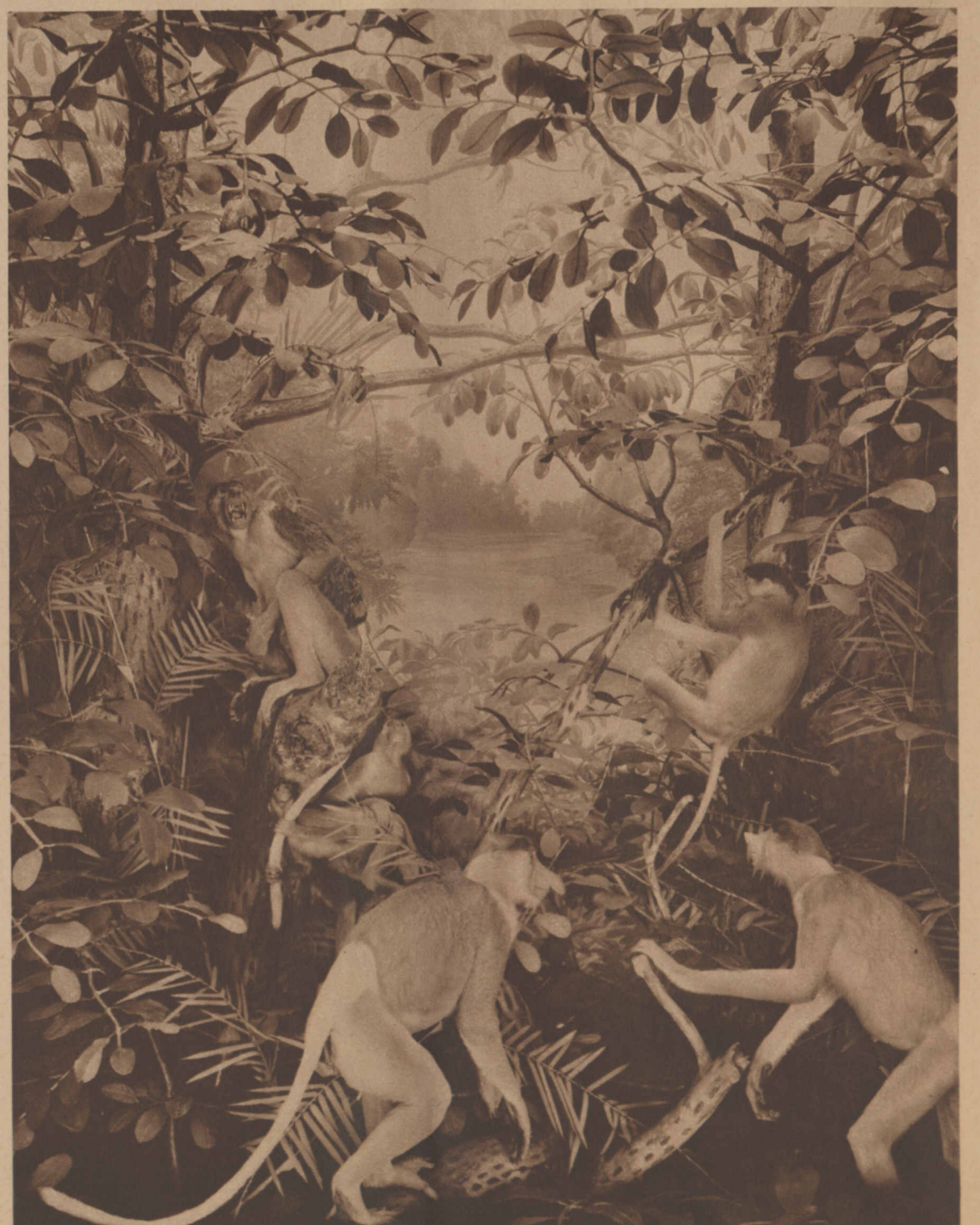
PROBOSCIS MONKEYS FROM BORNEO—A new habitat group at the Field museum.

The silk parade will embrace everything from this to this to this