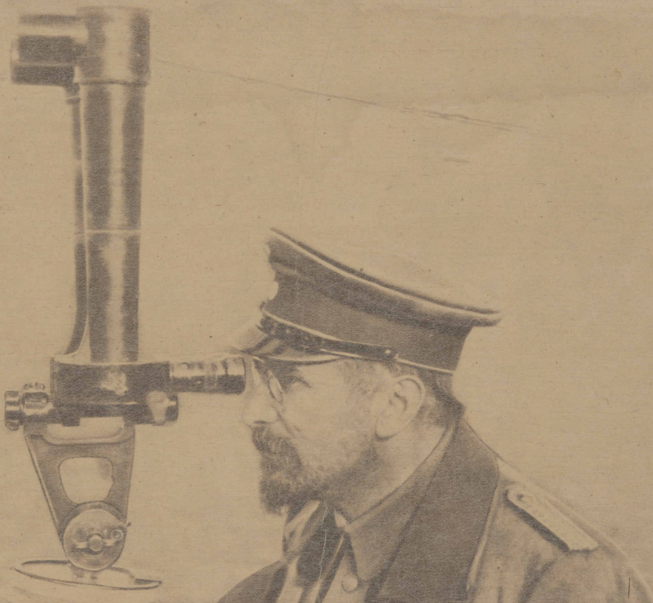
A German artillery officer directing the firing on Reims. His professional air well reflects the scientific business that war has become. The instrument is a combined binocular periscopic range finder. The wires of a field telephone appear overhead.