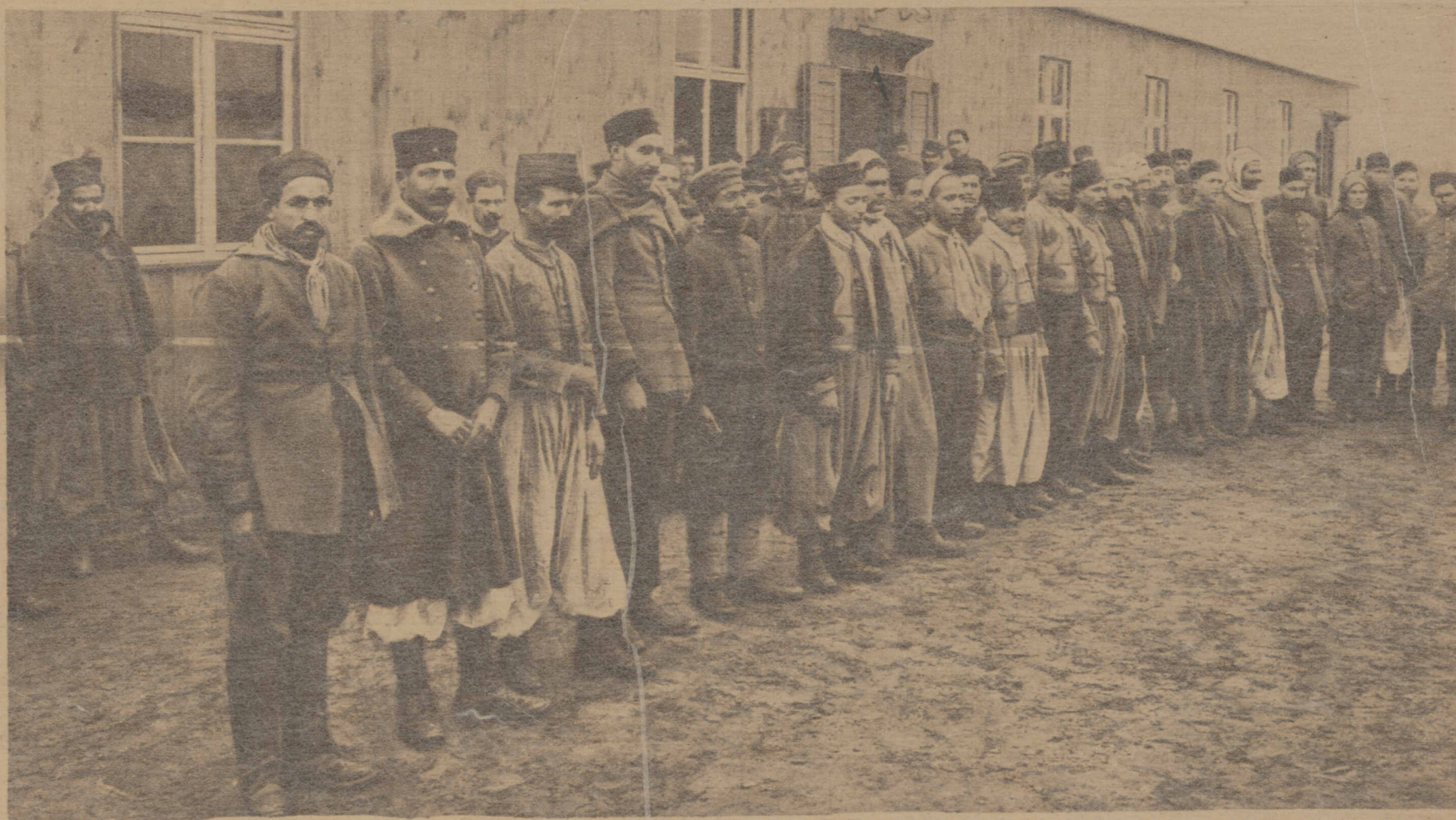
An array of ally prisoners in the German concentration camp at Zossen. Turcos, Algerians, Hindus, and other colonials appear in this cosmopolitan collection. The official German photographer found them looking contented.