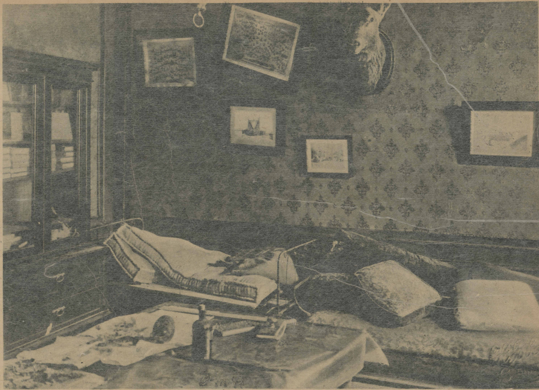
WHERE THE CZAR AND HIS FAMILY SPENT THEIR LAST DAYS —The room in the house at Ekaterinburg, Siberia, from which, according to the generally accepted story, the Russian royal family was led to be murdered by the reds. The execution, it is said, took place in a room on the floor below at 2 o'clock on the morning of July 17, 1918.