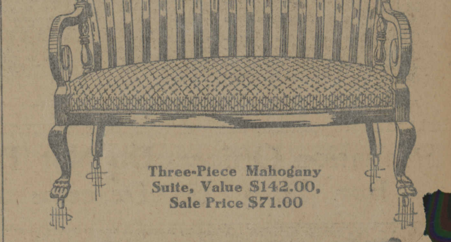
Three-Piece Mahogany Suite, Value $142.00, Sale Price $71.00

Only one of each pattern. See illustrations and prices below.