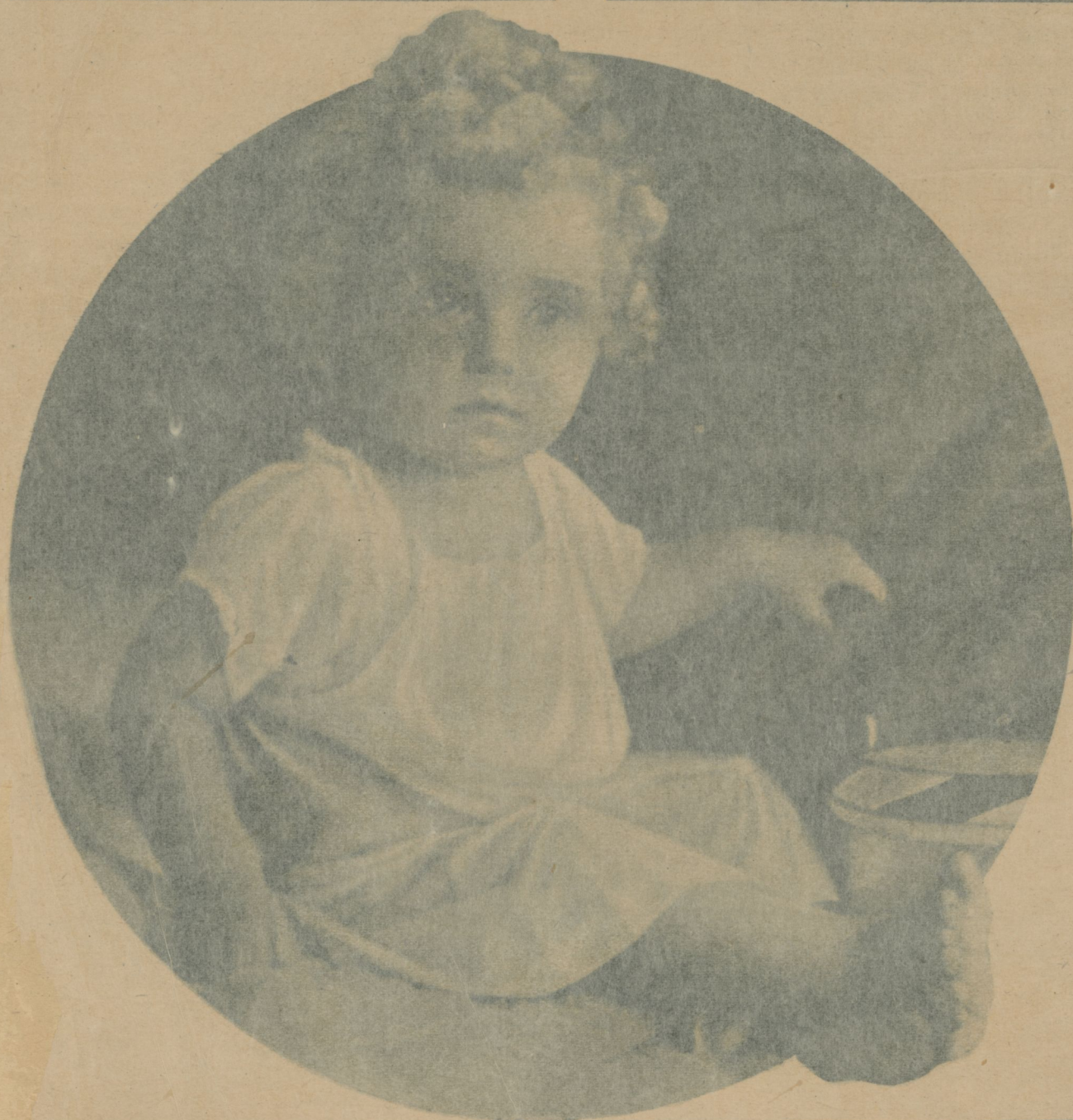
HEIR TO THE AUSTRIAN THRONE —Archduke Franz Josef Otto, eldest son of the new emperor of Austria and king of Hungary, Karl Franz, who succeeded to the throne on the death of Emperor Franz Josef.