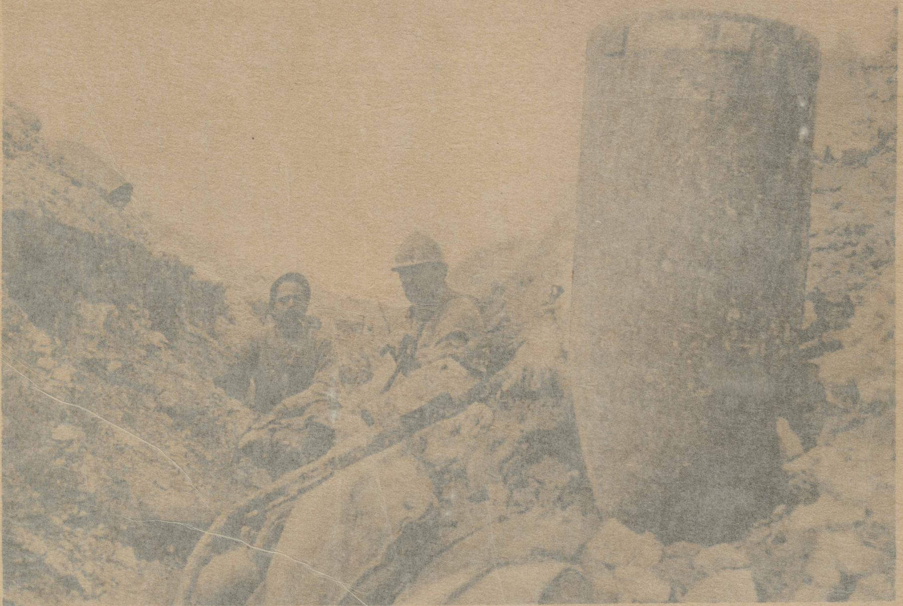
AN UNEXPLODED 42 CENTIMETER SHELL —This huge projectile, fired from one of the great German "Busy Berthas," manufactured in the gun works of Frau Bertha Krupp von Bohlen, landed unexploded in an already badly damaged French trench on the Somme front.