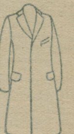
One Grade, $2.00

130 North State Street Room 30 Central 4875