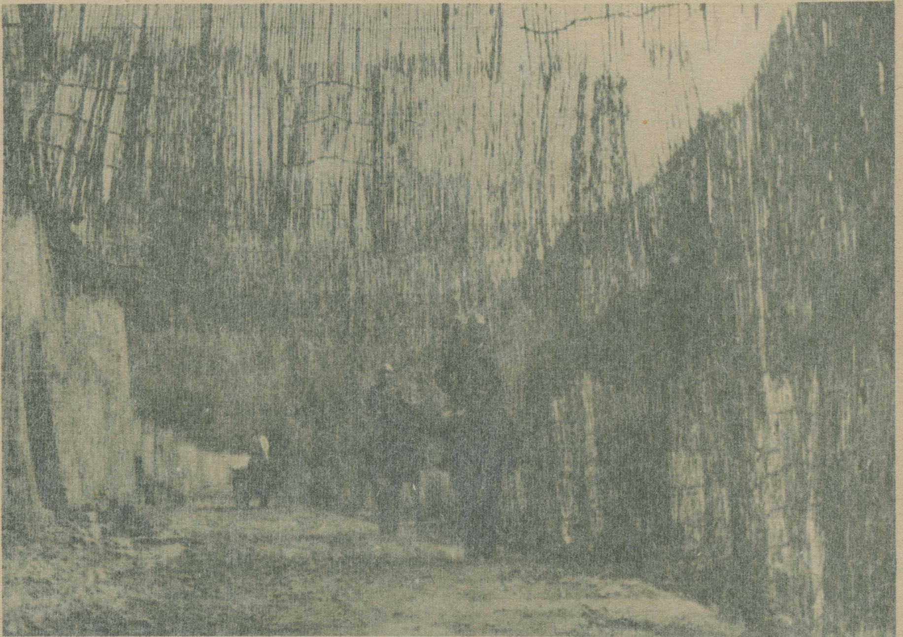
LIKE A GORDON CRAIG SETTING FOR A GREEK DRAMA is this remarkable example of the art of camouflage developed by the war. Mats of straw and wicker completely hide a military road in the valley of Astico in Italy.