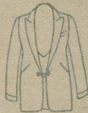
Three Grades, $3.00, $4.00, $5.00

clothes which we make to rent for weddings and formal affairs are made to fit—for we do fit our customers perfectly.