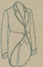
Two Grades, $4.00, $5.00

clothes which we make to rent for weddings and formal affairs are made to fit—for we do fit our customers perfectly.