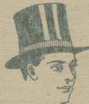
Silk Hats, $1.00

THE man that is "hard to fit" will find to his surprise that our famous