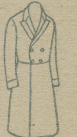
One Grade, $4.00

They are tailor made and tailor made clothes cost most, as you well know.