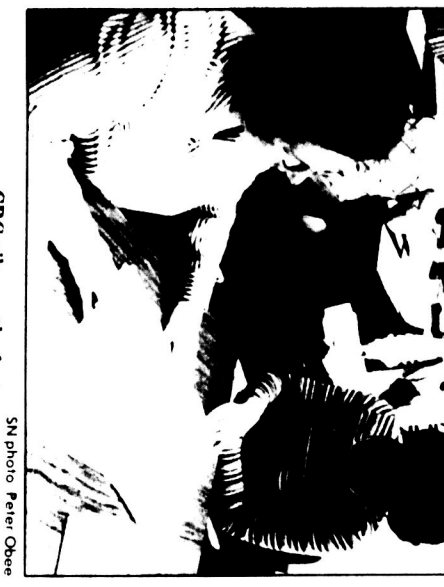
CRC piles on the facts