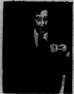
PITIRIM SOROKIN relaxes back stage after his talk to the Honors College Thursday night.

He said that while 95 percent of the economic functions of Soviet Russia are controlled by the government, 60 to 70 percent of American industry is likewise controlled, with the control of America's 200 corporations in the hands of boards of directors who own less than two percent of the stock.