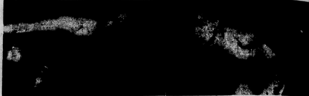
DEE EDINGTON ... 400-yard medley relayman ...

now—see the wider selection of models at your local authorized Chevrolet dealer's!