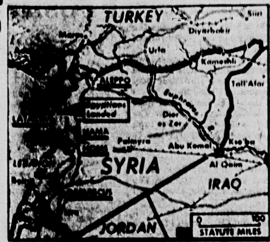
As tensions grow over charges that Turkey is planning to attack Syria, officials said arms have been issued to Syrian "resistance" organizations along the Turkish border. Syrian forces have also been bolstered by the arrival of Egyptian troops.

Even candles are reported difficult if not impossible to obtain in Budapest.