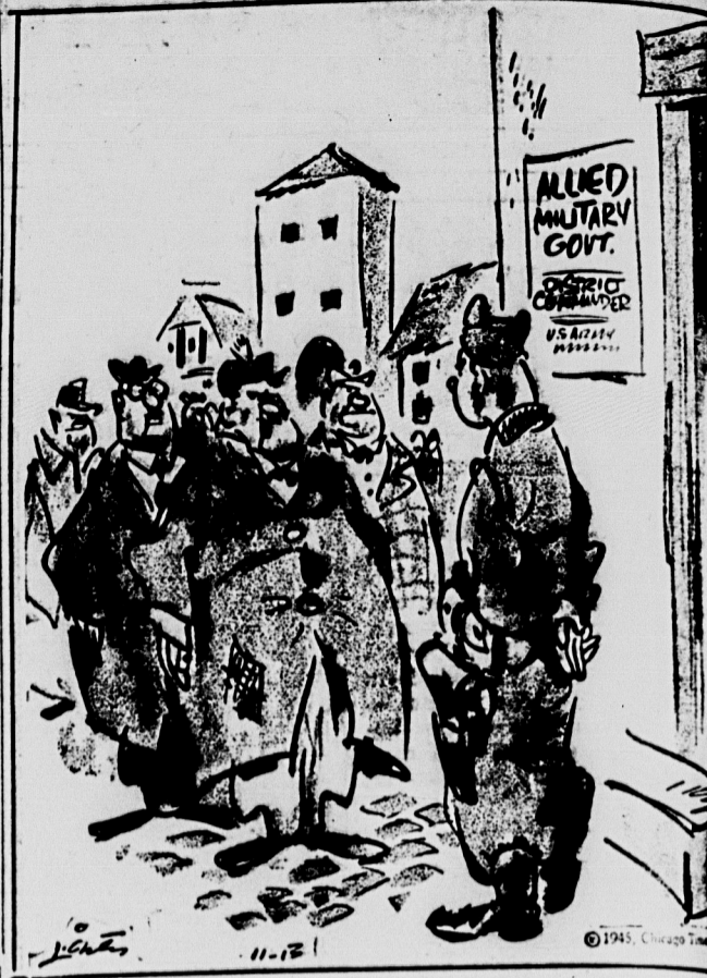
"We wish to protest vigorously to the Allied Commander that we Germans need badly food, clothing, fuel, Atomic bombs"