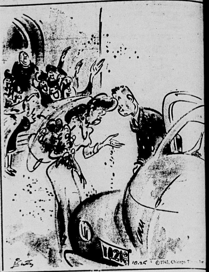
"Why it's wild oats they're throwing!—Wilbur is there something in your past you haven't told me about!"