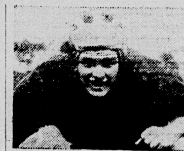
... Tomasi ...