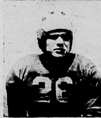
... Ponsetto ...