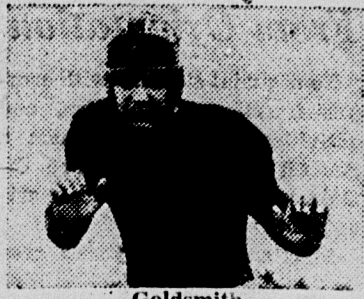
... Goldsmith ...