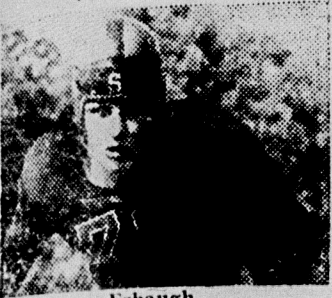
... Esbaugh ...