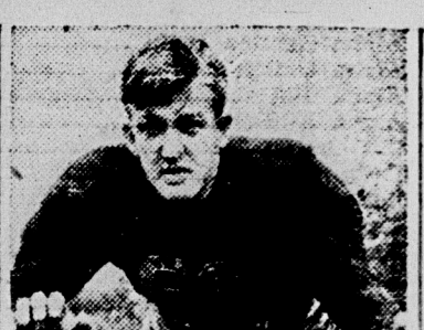
... Lamssies ...