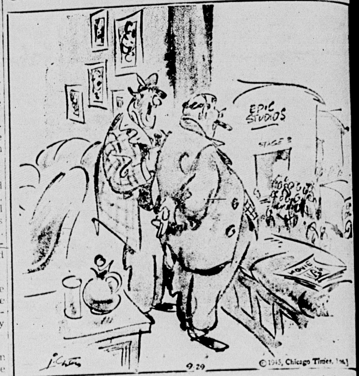
"We got a lot of extras hanging around, Chief—why don't we do a picture on mass unemployment?"