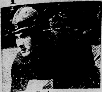
... Barbas ...