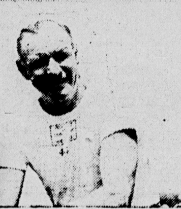
... Crisler ...