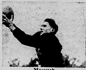
... Massuch ...