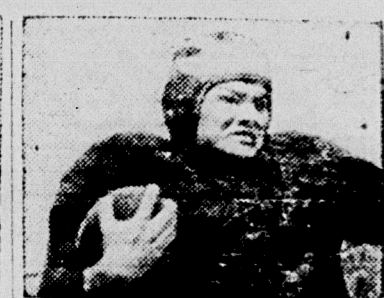
... Teninga ...