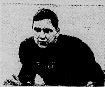
... Black ...