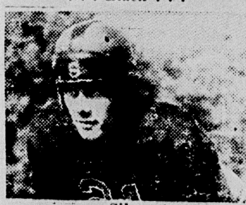
... Siler ...