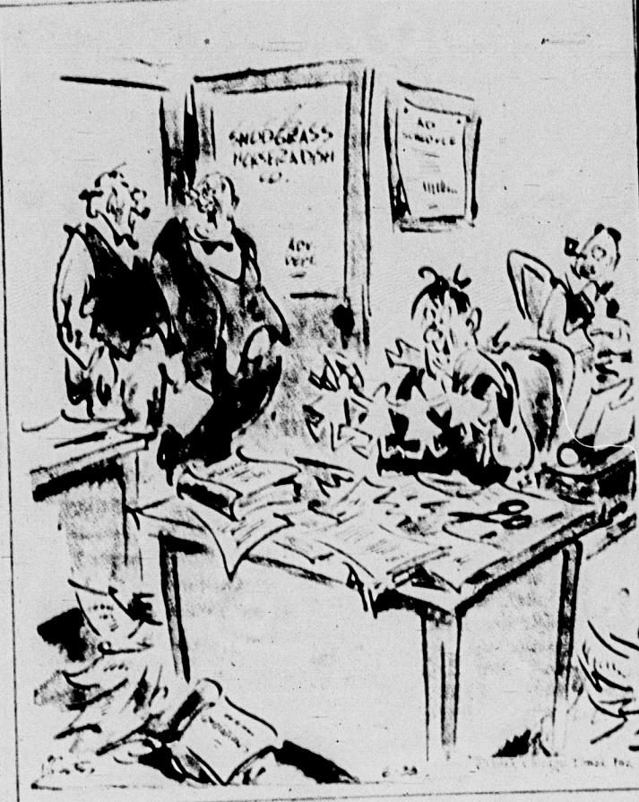
I merely asked him to write a simple ad combining the idea of the returning soldier, sweetheart, a vine covered cottage, molasses, and Smokey's Horseradish.