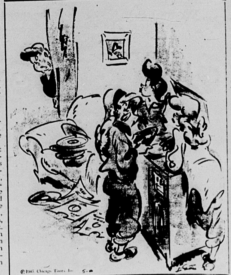
"Oh, Mamma is just at the awkward stage—too old to understand the way we behave, and not old enough to be philosophical about it!"