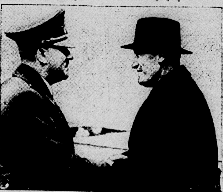
ADOLPH HITLER, left, greets BENITO MUSSOLINI back in the days when the Axis still had hopes of winning the war. Now Mussolini has been killed by his own countrymen, and Hitler has been reported slain by the rapidly advancing Russians.

ROME, May 1 (AP) —Fascist commander Marshal Rodolfo Graziani announced the unconditional surrender tonight of his Italian army as New Zealand troops moved up with Yugoslav forces near Trieste at the head of the Adriatic sea and American units moved for the southern part of the Brenner pass into Austria.