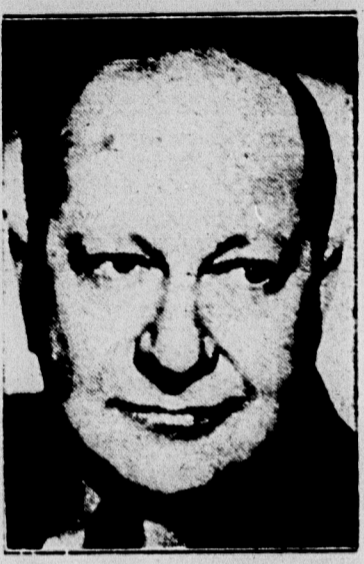
SIGMUND ROMBERG ... composer ...

This is Romberg's third annual concert tour. During this round-the-nation trip he will visit again convalescent hospitals to play for the service men.