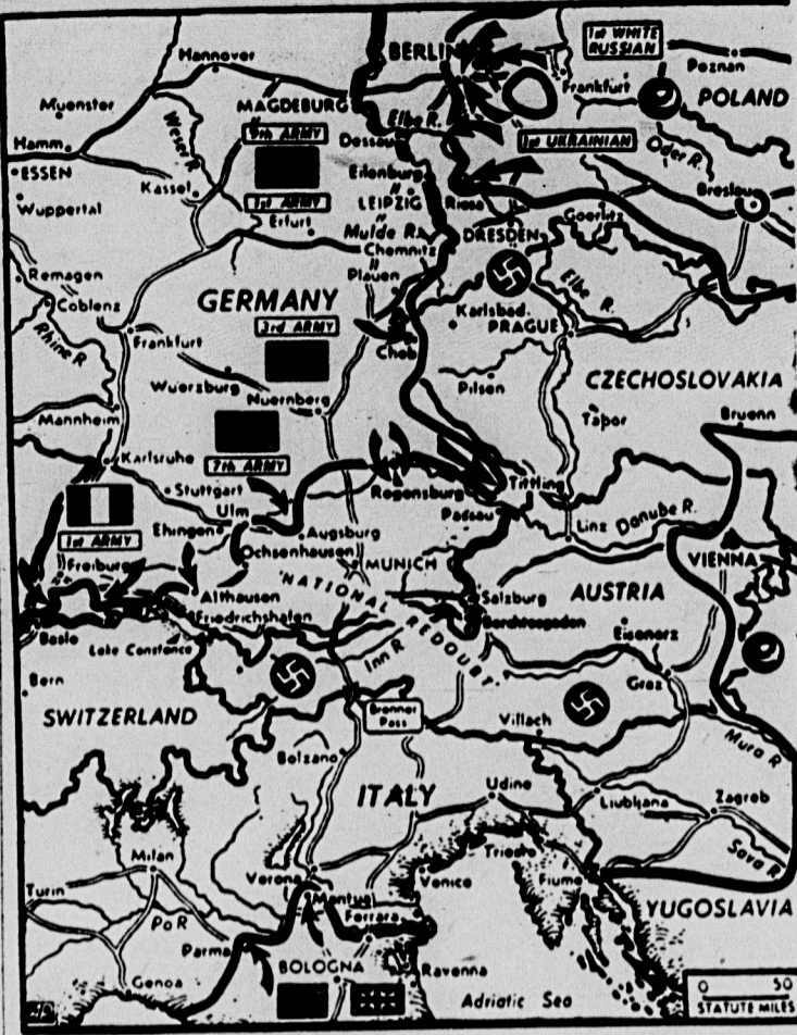
On the western front, the U.S. third army has reached Titting in a drive toward Austria and has crossed the Danube on both sides of Regensburg. On the eastern front, the Russians have encircled Berlin and are fighting in the capital. South of Berlin, Red troops crossed the Elbe river to capture Riesa. In Italy the Allies took Parma and Mantua.