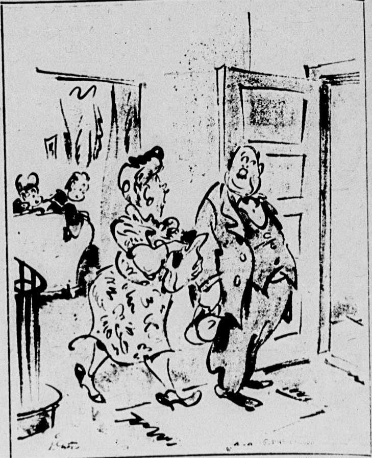
"Why, I think he's a nice boy—and just wants to tell his experiences—I just heard him say something about coast being clear!"