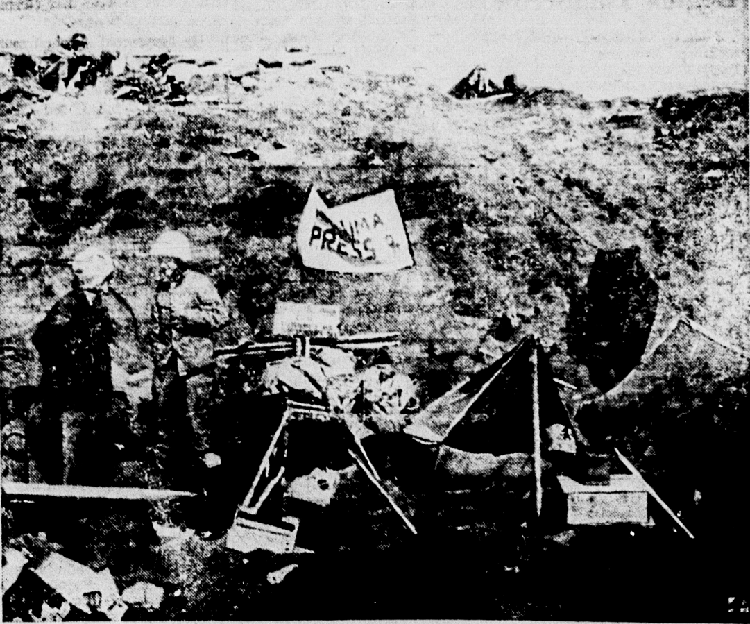
Holes scooped in volcanic as hserve as news and photographic headquarters for the men