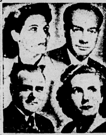
FOUR OPERA STARS to sing tonight