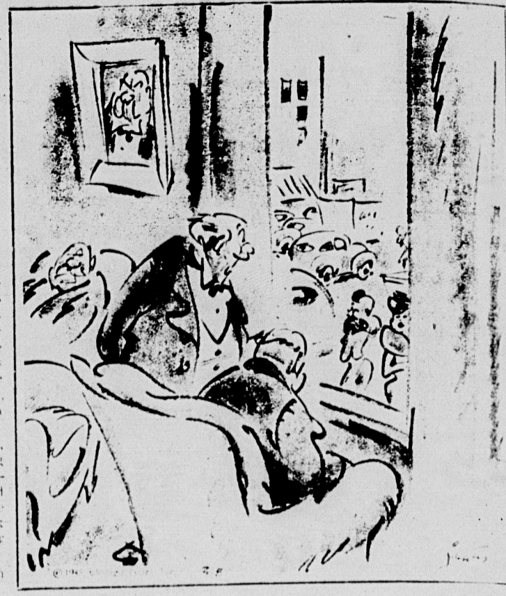
"Looks like spring should be here soon. Spotted the girls' bare legs are losing that mottled, purplish . . ."