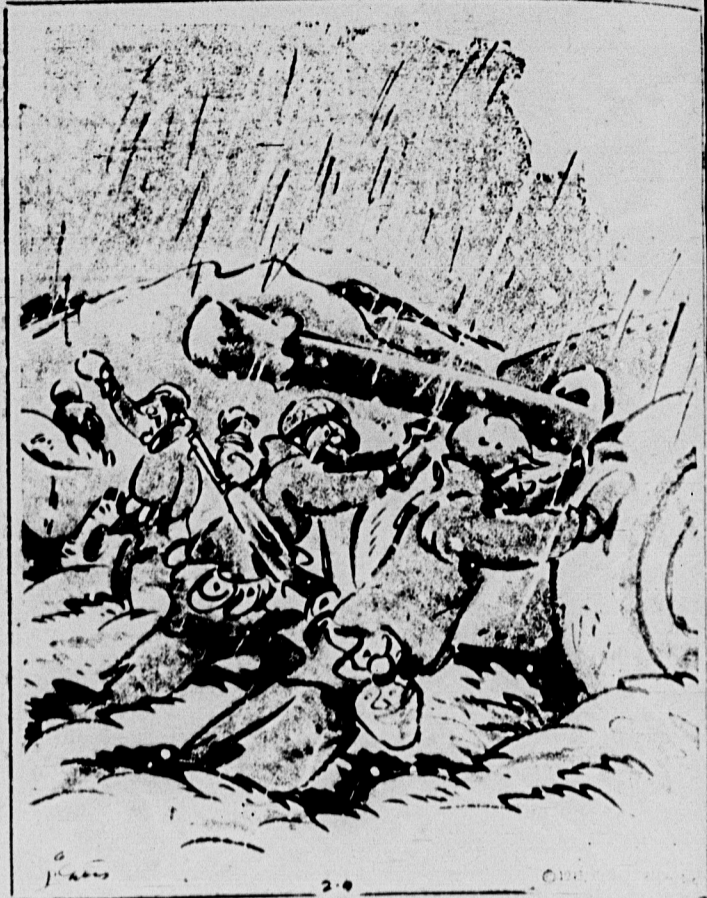
It'll be just like these knaids to fight until we get decent spring weather and then quit on us.