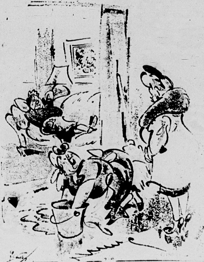
It was a mistake to tell our new maid I'd show her how to do the work done. I've been showing her all week, and she still hasn't caught on!