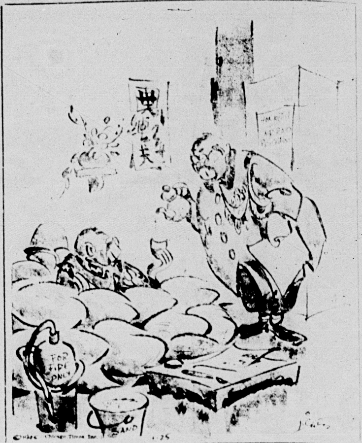
"Don't say report U.S. people cannot display emotion in order." In radio studio, audience forced to respond to jokes when "laughter" sign is held up.