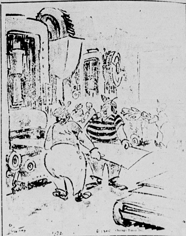
"I guess I can't take weekends anymore. I'm not making it in a kitchen!"