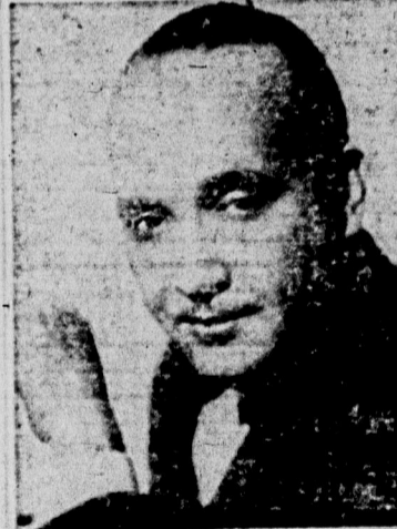
FLETCHER HENDERSON ... a solid sender ...