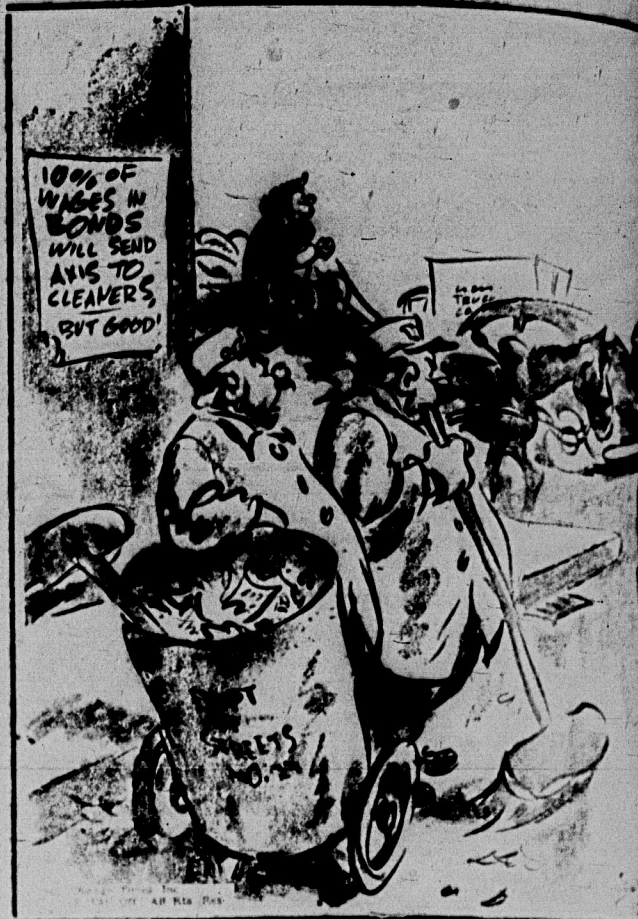
"It's getting too darn easy to find work these days."

A Denver, Colo., grill offered a free hamburger for each five pounds of scrap brought in by customers.