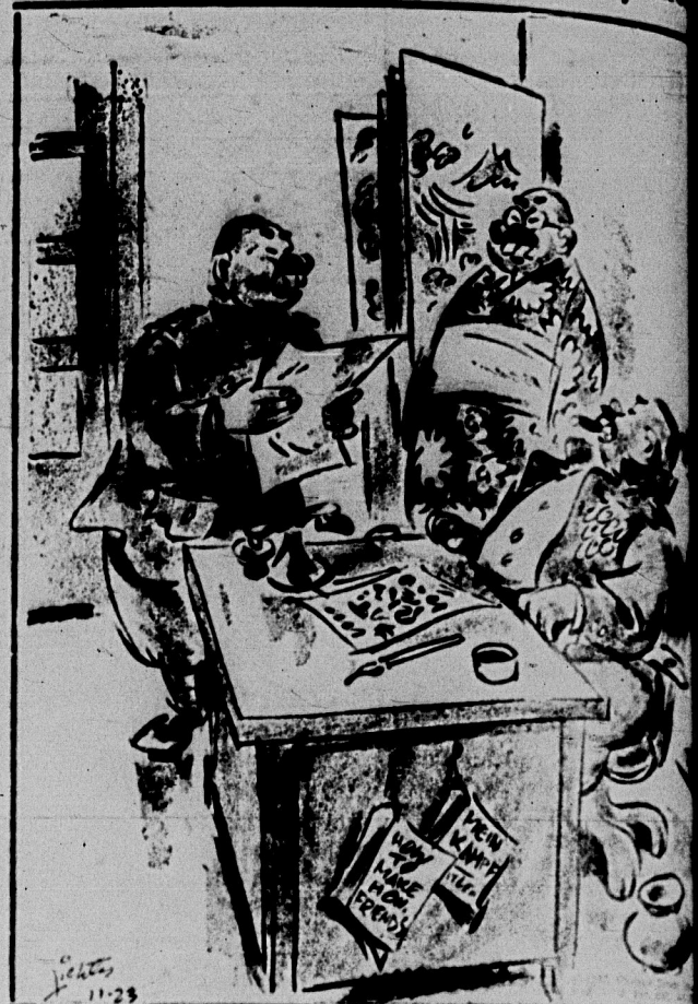
"Hon. spy happy to report U. S. Army camp in East Lansing." "Army is full of dread plague of rumor."