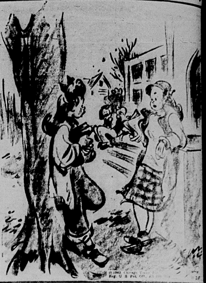
Mama says I'm too young to think about it's a much easier subject than algebra